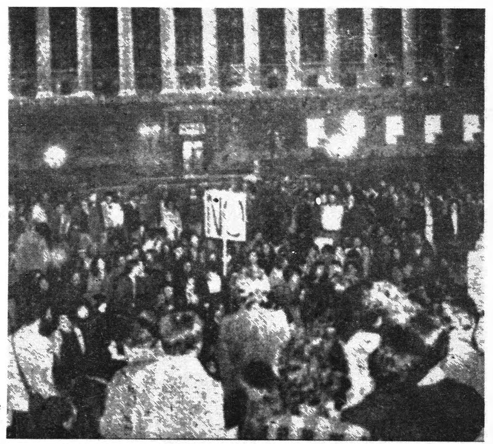
Angry students and neighbors gather in front of Columbia University in New York City to protest against nuclear reactor project. The adminis tration has decided to drop the project