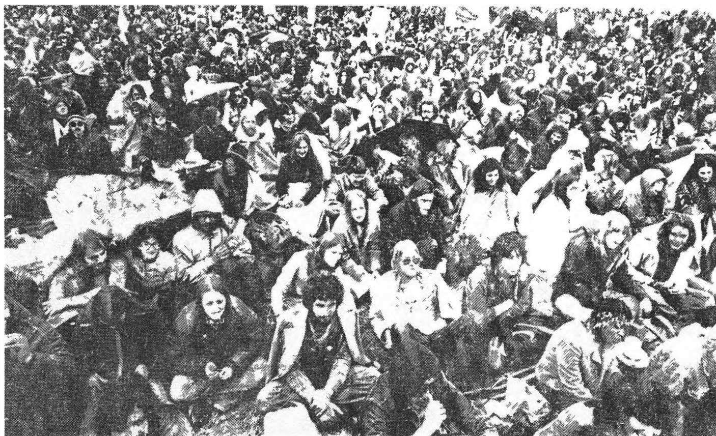
Demonstration against nuclear weapons facility in Rocky Flats Colorado — an excellent opportunity to raise anti imperialist consciousness

Some anti nuclear forces call for conversion of war industries into spending to serve human needs. Of course, the people of the US can agree with that. But it