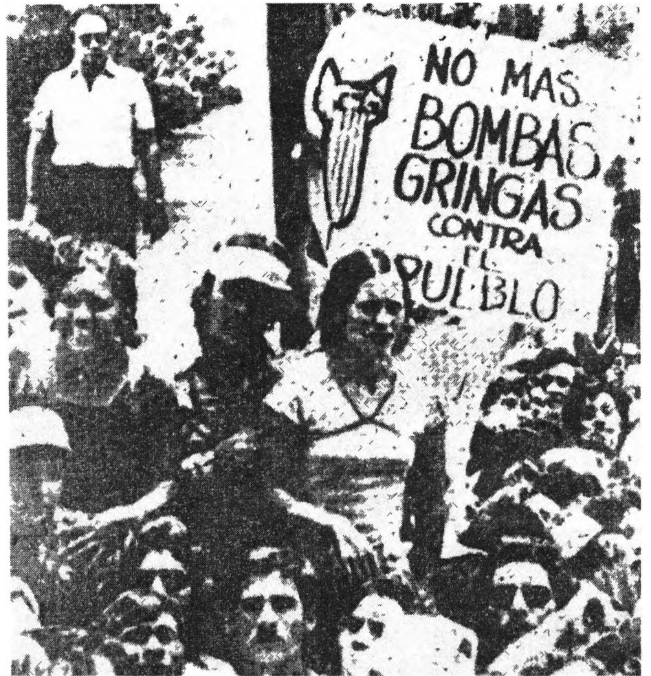
Anti-imperialist character of Nicaraguan revolution reflected in demonstrators sign "NO MORE YANKEE BOMBS AGAINST THE PEOPLE" See more articles on Nicaragua on p. 2