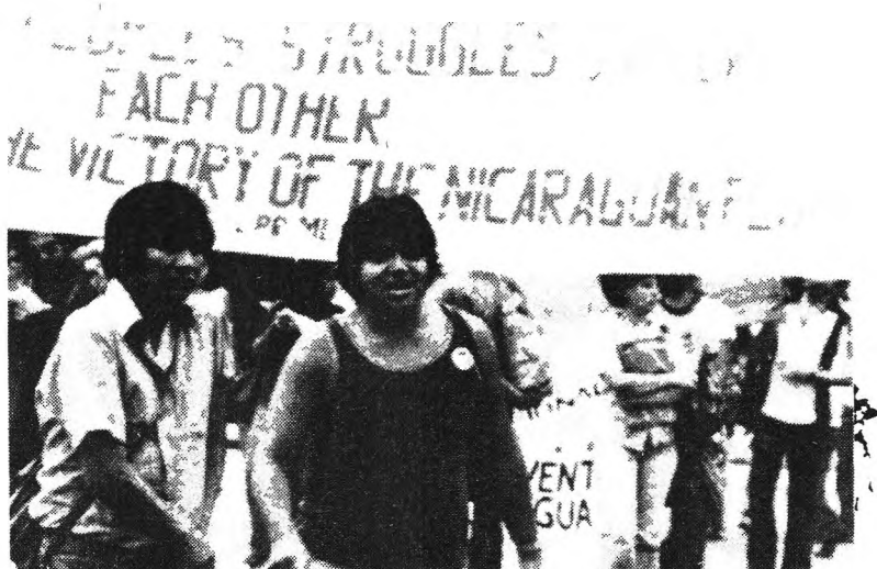
Talk about Proletarian Internationalism means nothing unless accompanied by deeds LPR (ML) mobilizes to Washington DC in support of Nicaraguan revolution

A lot has been said by different organizations about the character of the Nicaraguan revolution