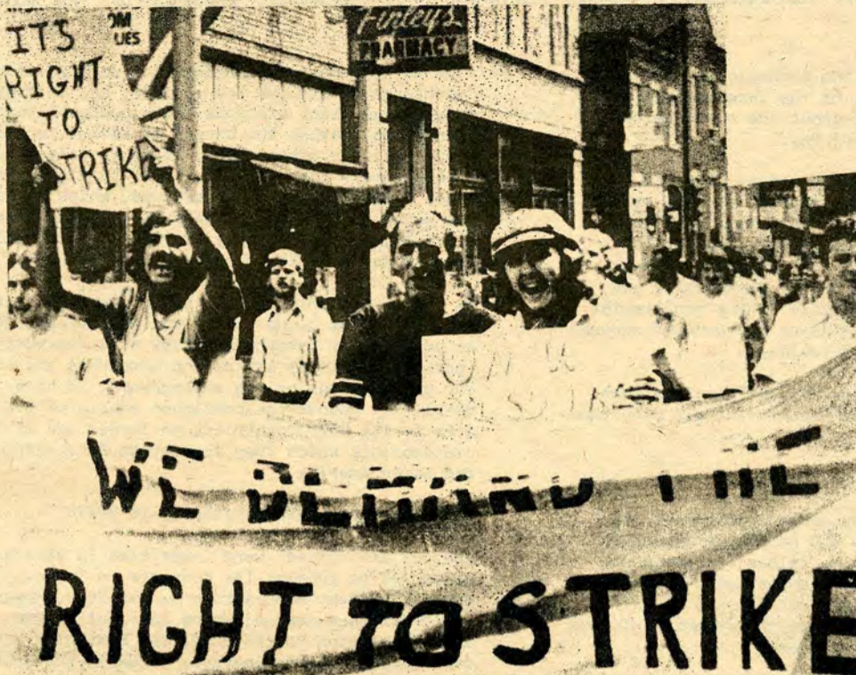
Charleston, W. Va., miners demand the right to strike at Aug. 25 demonstration.

In exposing Carter and his administration we must not commit the grave error of individualizing his case as if it existed isolated from the class interests which he represents. Carter is a high level representative of the capitalist class and is at this moment head of a highly repressive apparatus of the bourgeoisie against the interests of the workers and the vast majority of the people. To understand the danger that Carter's illusive demagoguery represents, but at the same time to isolate it from the reality of which he is the exponent, defender and servant of the exploiting class - could lead to a serious right error of considering him the principal enemy and would therefore lead us to divert our struggle from its principal objective - the capitalist class as a whole. While exposing Carter we must expose the class essence of his actions and political style, emerging from a decadent capitalist system submerged in a deep economic and political crisis, which is leading to preparations for war and fascism.