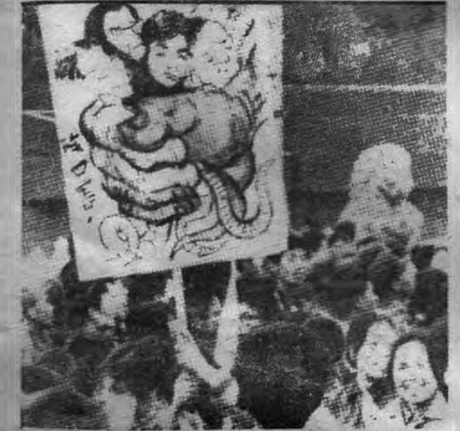
Chinese masses show, through their deeds as well as their art, their readiness to stop capitalist roaders dead in their tracks!

We must support the right of the Chicano peo-