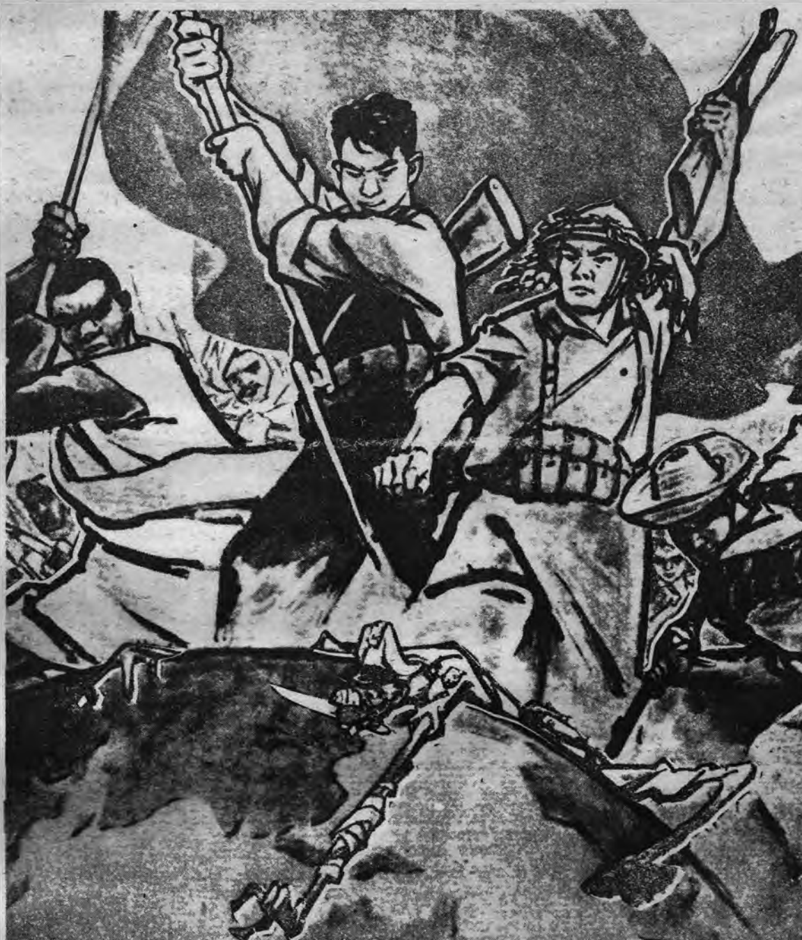
DEATH TO US IMPERIALISM AND SOVIET SOCIAL IMPERIALISM!!