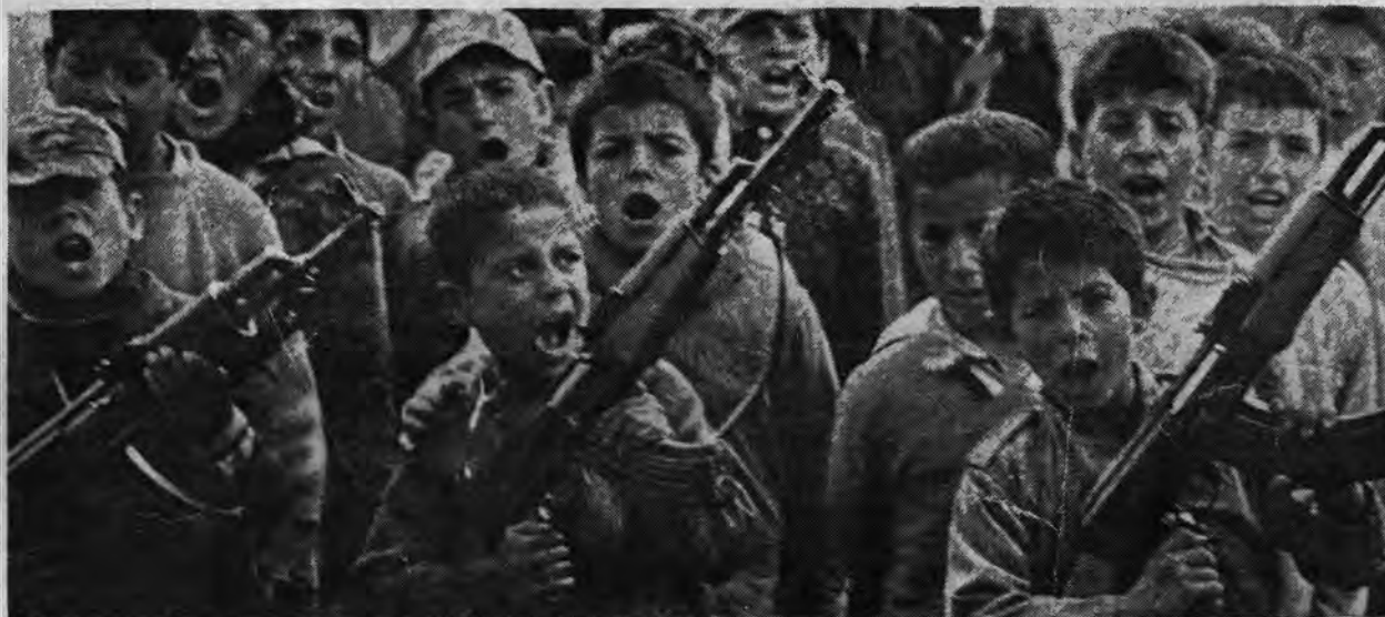
Young Palestinian liberation fighters.