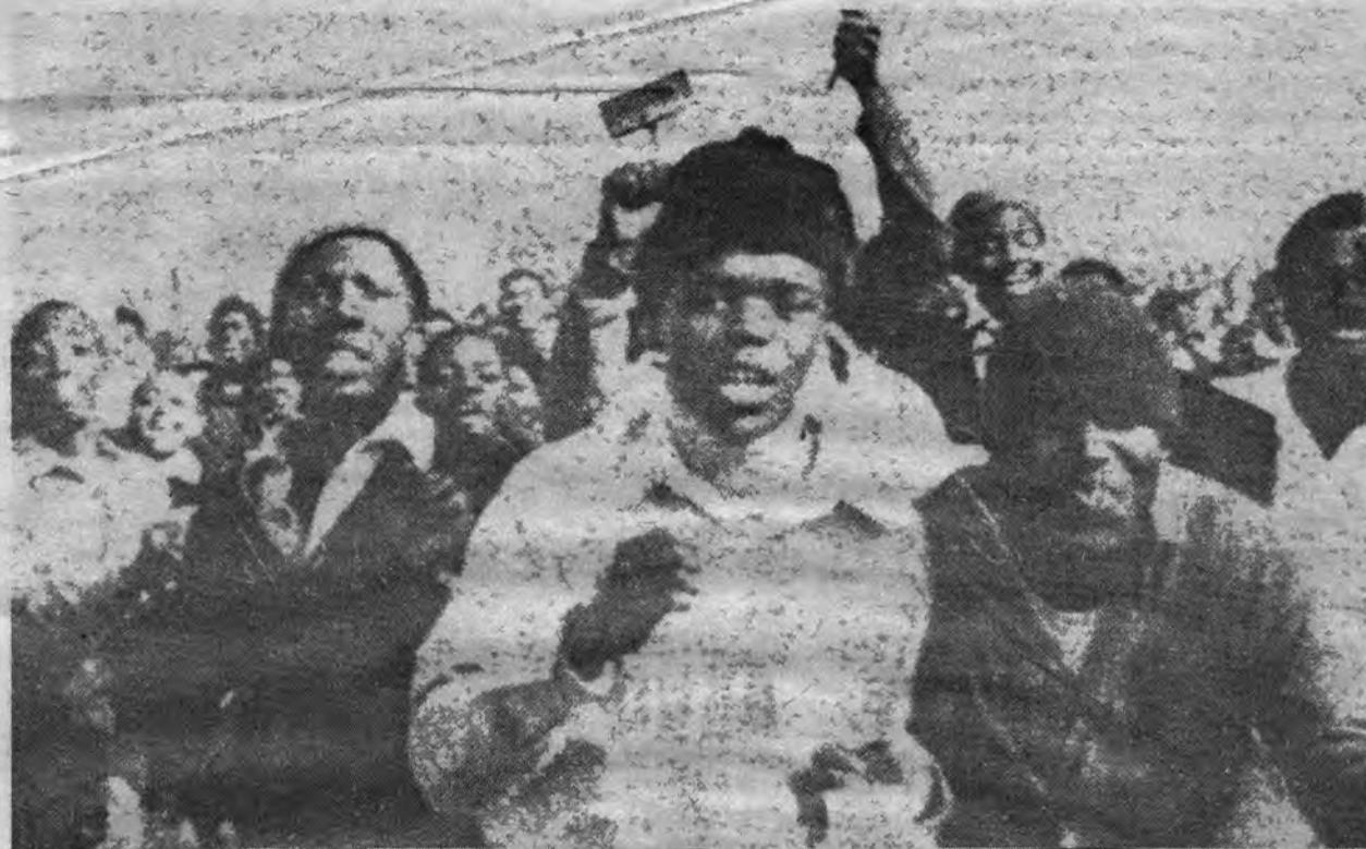
THE PEOPLE MAKE HISTORY : AZANIAN STUDENTS AND WORKERS rise up against the racist regime of South Africa, demonstrating that revolution is the main trend in the world today.

The flames of mass struggle have swept across Azania as the Azanian people deliver blow after blow at the fascist and racist white minority rule and its apartheid policies (laws designed to forcibly keep the Azanian people in slavery by restricting their movement geographically, socially, economically and politically). Ever since the uprising of black students in the Soweto Township of Johannesburg and the new upsurge of the struggle in early August, the most ferocious revolutionary storm since the uprisings of 1960 has engulfed most of Azania.