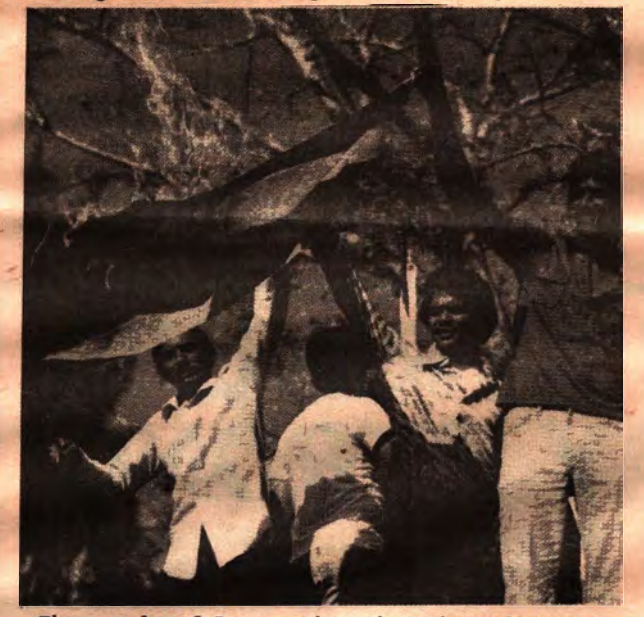
The people of Panama show their hatred towards U S occupation of their country by burning a replica of a U S. flag

The Panamanian people have never stopped fighttearing down the US flag - the hated symbol of