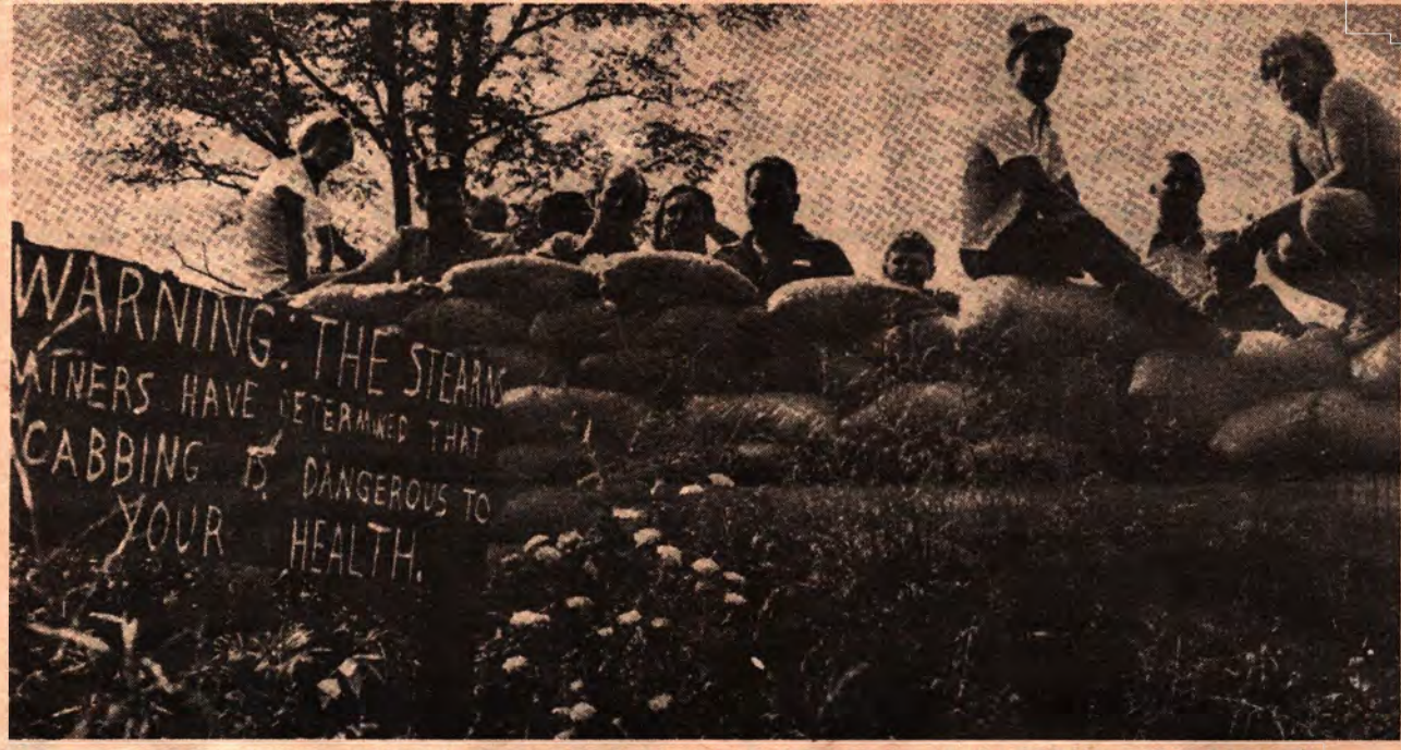
Striking Stearns miners in Kentucky stand behind barricades to defend themselves against company thugs. These miners have set an example by taking up armed struggle to protect