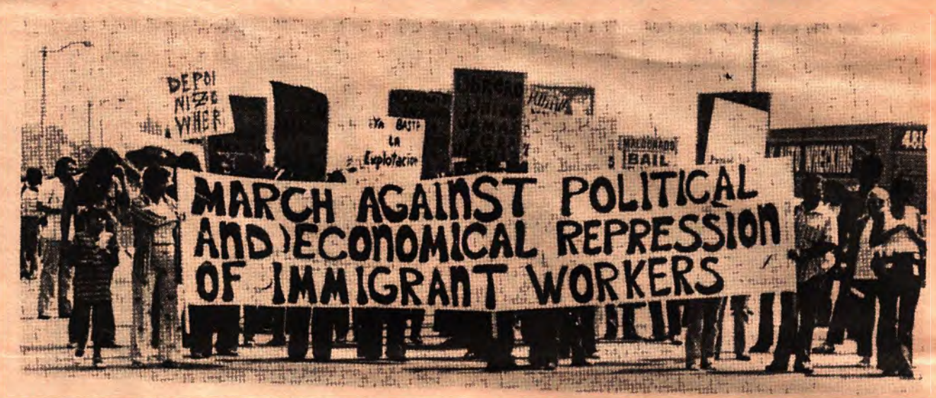
Workers and students across the country march in favor of democratic rights for undocumented workers

So who likes the ammesty plan? The capitalists In spite of the proposed $1000 fine for every "illegal alien" hired, farm operators and factory owners seemed pleased. They face little chance of conviction since in order to fine the employers, the government must first prove that they "knowingly"hired undocumented workers. The capitalists will still have their pool of cheap labor. They will still call on the INS to deport workers during a union organizing drive or strike Carter's plan, while making token concessions to undocumented workers, will in fact