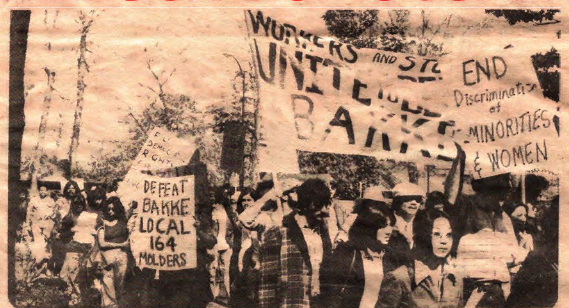
The hard-won gains of the '60's will be lost without a revolutionary fight. Here student and workers demonstrate against the Bakke decision earlier this year in San Jose

But with the imperialist economic crisis of the 1970's, the ruling class is attempting to take away these gains. People around the world are rising up against US domination. The US is increasing its rivalry with the USSR for control of the world's markets and resources. The two superpowers are preparing for a new world war To make up for lost profits the imperialists intensify the exploitation of working people and