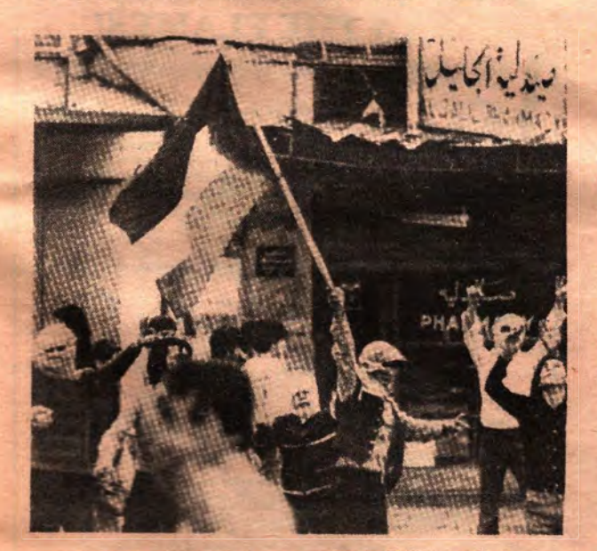
Palestinian students protesting Zionist occupation of the West Bank

In recent weeks the Zionist government of Israel has stepped up its attacks on Palestinian and Arab peoples by invading Southern Lebanon. At the same time the two superpowers are continuing their rivalry to control the vital mid-east area. In particular, various spokesmen for US imperialism have been holding high level meet-