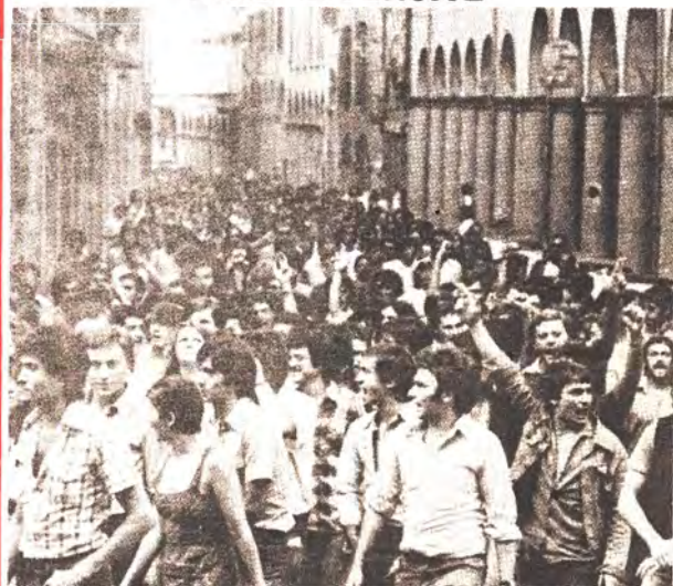
Thousands of students and workers from all over Italy march against the revisionist policy of the Italian Communist Party (PCI) and the Italian government.

On the weekend of September 23-25, Italian anti-revisionist forces held an International Conference Against Repression. Organized mainly by Lotta Continua, composed of several anti-revisionist groups, the gathering was to protest the repression of political dissidents. Conference organizers denounced the revisionist Italian Communist Party (PCI) because they endorsed legislation which empowers police to shoot "terrorists" at will. This June the PCI signed the "programmatic accord" which authorizes the police to wiretap, to detain anyone up to 24 hours, carry out searches without warrants, and other repressive measures. The conference culminated with 50,000 marchers taking to the streets of Bologna. The resulting apprehension of the capitalists was reflected in the London Financial Times when it spoke of the marchers as "the nucleus of a potentially serious new political force in Italy."