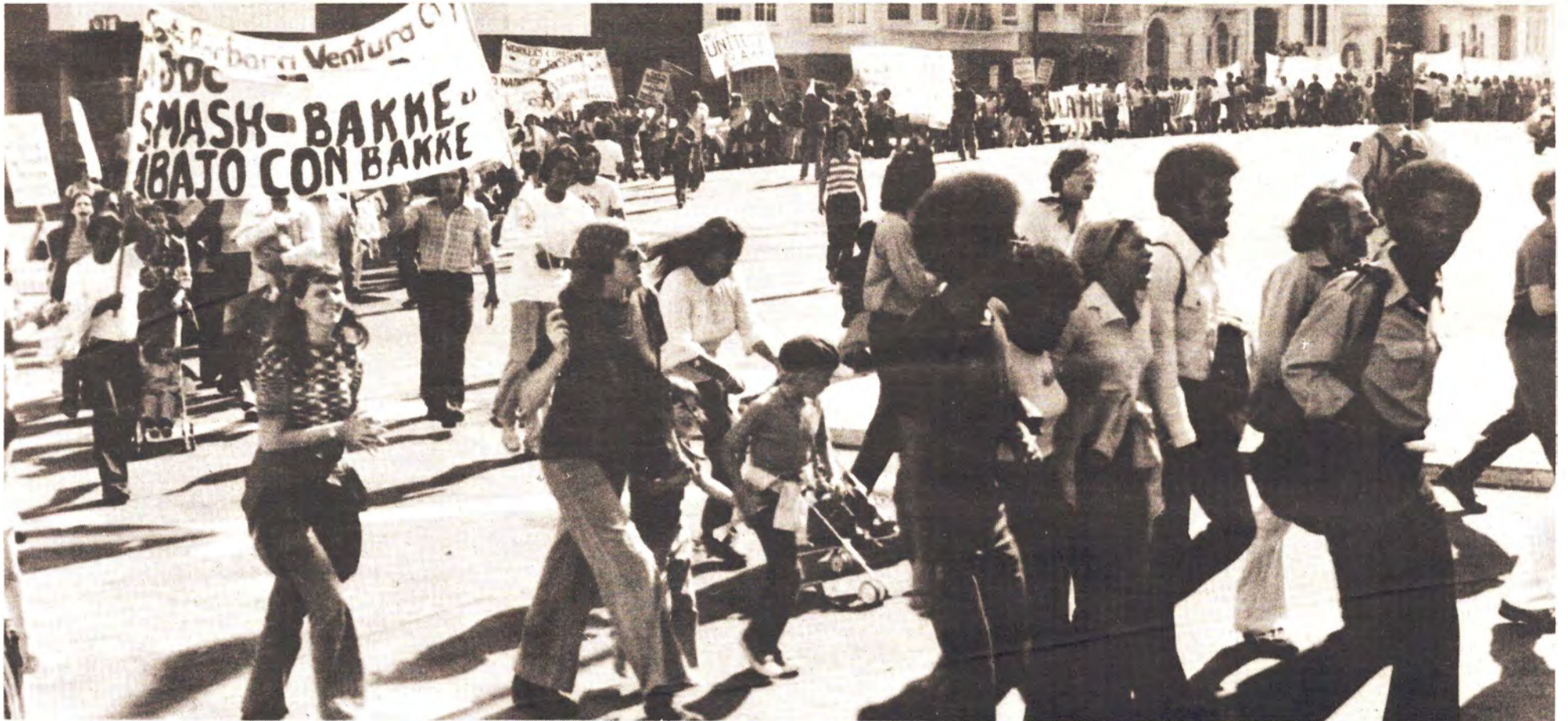
Almost 4000 people from all over California marched against the Bakke decision.

Almost 5,000 people nationwide demonstrated against the Bakke decision October 15. Just days after the US Supreme Court heard oral arguments in the case, the Anti-Bakke Decision Coalition held mass demonstrations in San Francisco, Atlanta and Boston. Approximately 4,000 people marched from San Francisco's Dolores Park to the Federal Building. Chanting slogans like "Courts and Regents, you can't hide, we know your're on Bakke's side," the thousands of demonstrators formed a militant and disciplined march through Latino and Black working class districts of San Francisco. The demonstration was endorsed by over 100 organizations including numerous workers caucuses, two locals of the United Auto Workers, three United Steelworkers locals, student and community groups from throughout the state.