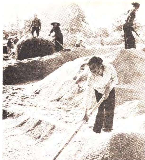
Harvest in Hung An Cooperative farm in Hai Hung province. The people of Vietnam are struggling together to re-build their country.