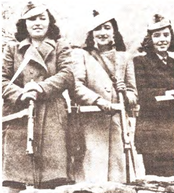
Women played an important role in smashing the fascists in the war for National Liberation.

Long live the friendship between the Vietnamese and American Peoples!