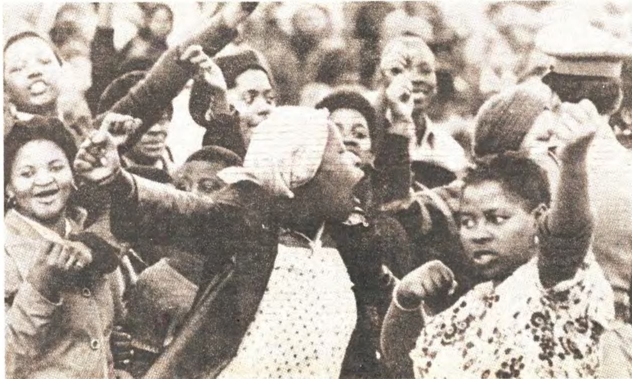
The Black people of South Africa (Azania) grow stronger in their determination each day to overthrow the brutal Vorster regime. This demonstration in Cape Town is one more revolt against apartheid.

On October 19 the South African government outlawed 18 Black anti-apartheid organizations, and arrested 70 Black leaders and supporters. It closed down THE WORLD, South Africa's largest Black newspaper, an advocate of non-violent change for South Africa. The Vorster government followed up these actions by arresting 97 Indian adults and youths who were protesting the apartheid policy of the racist regime. All public gatherings have been prohibited. In September the Vorster police had brutally murdered Black activist and patriot Stephen Biko; an act which had resulted in worldwide condemnation, and had sparked off massive protests in South Africa itself. Before examining these events more closely let us look at a little background to the situation in Azania (South Africa).