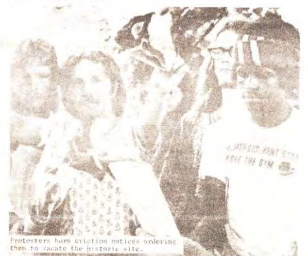
Protesters burn eviction notices ordering them to vacate the historic site.

The students at KSU and the many other students and progressive people are determined to win. They won't allow the University to destroy the anti-imperialist history at Kent State. The real history of the 1960's lives on in the struggle to defeat future imperialist wars and the system that causes them.