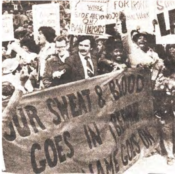
Angry Zenith workers in Chicago last month protested the plant closing. Instead of attacking Zenith, however, the company union diverted the workers anger and called for banning foreign imports.

As the R.C. goes to press the 45 day stike of 24,000 Boeing workers will end if the workers accept the proposed contract. While no information has been released on the contract, Rockwell International and McDonnell Douglas are paying close attention since their contract affecting 20,800 workers is currently under negotiation. Meanwhile Lockheed strikers are holding the line in Calif. and Georgia.