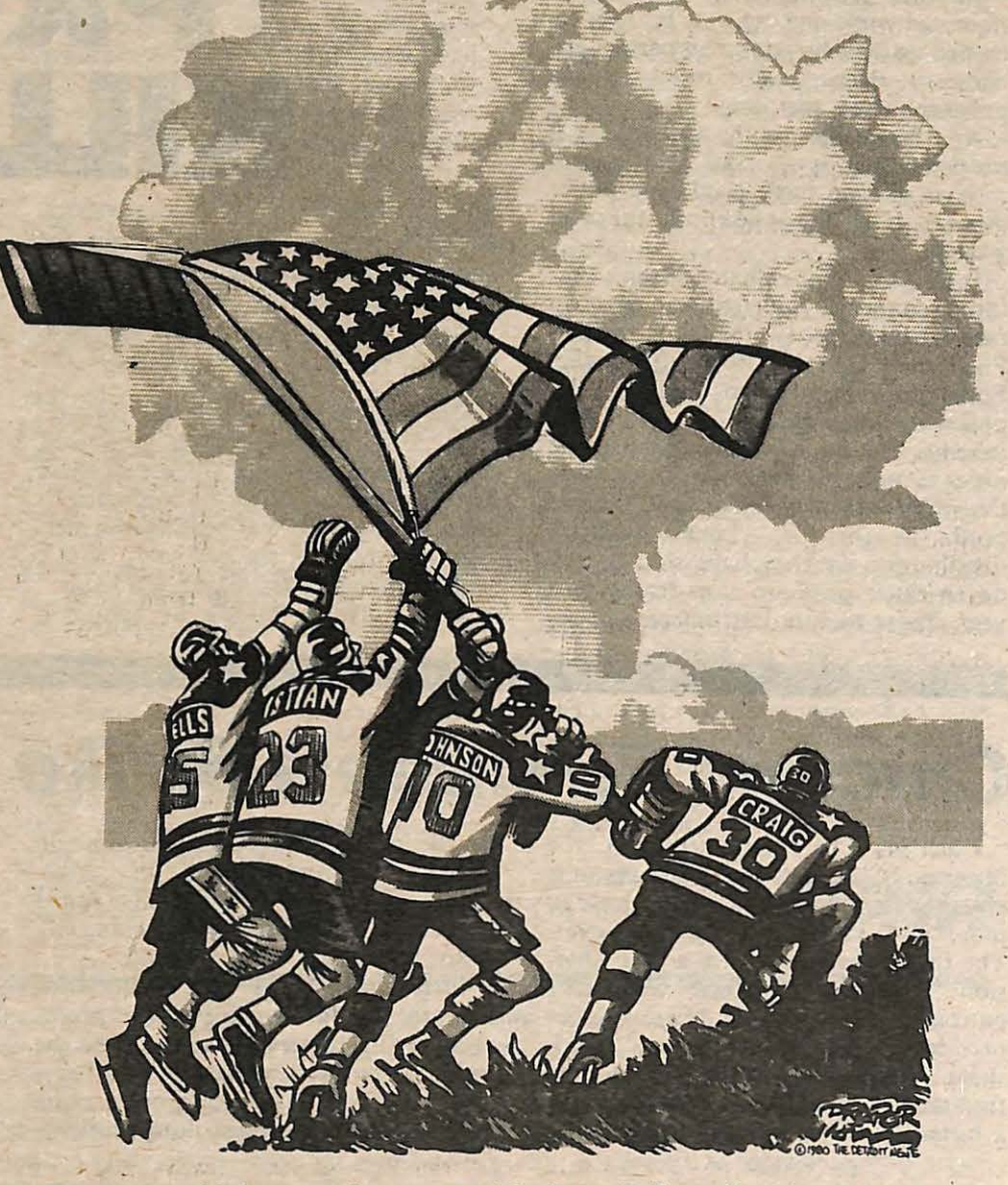
A cartoon which recently appeared in Detroit News (put in proper perspective by the RW)

pushed around by these little two-bit countries! Who the hell gives a damn about Finland? What has Finland got besides a little Vodka, anyway? Aren't they half-Russian? Most of them don't even speak English. If I'm correct there are no McDonald's or even a Burger King in Finland. So let them eat Borscht for all I care. And as to the nerve gas, we had the nerve and they got the gas, okay?