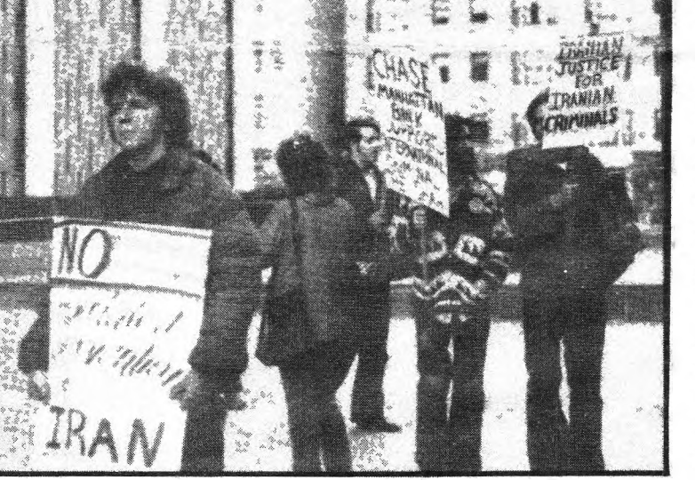
Demonstrators demand no intervention in Iran and extradition of the UNITE! photo Shah at San Francisco picket line

CPUSA/ML Leads Demonstration at San Francisco Federal Building In Defense of the Iranian People