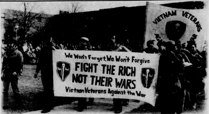
VVAW contingent leads march during October 22 demonstration at Kent State to protest the plans to build a gym on the site of the murder of four students in 1970.

Officials at Kent State University have planned to build a gym on the site of the murder of four students by the national guard in a protest against the war in 1970. While other sites were equally convenient and even less costly, they wanted to cover up the site, the murders, and all re-