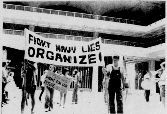
Demonstration near Pearl Harbor in support of the struggle to get the VRB. This Variable Re-enlistment Bonus was the first promised to Navy enlistees; then, after they were in, the Navy reneged. A several year struggle has won back the Bonus.

GIs united and backed their brother--his fight for safe working conditions was their fight too. They knew that if the brass got away with it this time, in the future they would