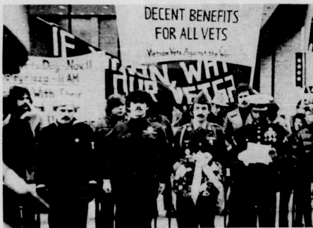
Wreath-laying ceremony during Chicago Vets Day

On Veterans Day, 1977, VVAW chapters and vets from coast to coast took a real shot at the band of thugs who run this country--the same bunch that tried to use Veterans Day to push their version of "national honor" and "national pride." Proclaiming "TO HELL WITH THEIR NATIONAL HONOR, WE WON'T BE USED AGAIN," VVAW took the battle around how vets are used--to fight wars for the profits of the rich and now again on days like Vets Day to push for future wars--right into the home park of the class that rules this country.