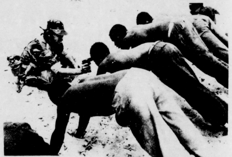
White Rhodesian trooper holds pistol on Black Rhodesian captives, supposedly "interrogating" prisoners. Despite racist government's claims about their interest in "majority rule," their actions show the nature of the system they have built in the country.

To say that most veterans aren't falling for all this crap is an understatement. In fact, VVAW is launching a campaign to equip a company of Black liberation fighters with uniforms and boots by May 1978. We continue to support the efforts of the African Liberation Support Committee including their demonstration in May which will pay a call on "human rights" Carter. As for the bloody terrorist scum of the Rhodesian army, American or otherwise, the people of Zimbabwe will find a suitable reward for them! ■