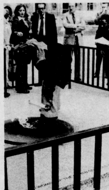
Chicago VVAW member burns honorable discharge papers during "federal Vets Day" on October 24th. Papers were burned in Chicago's "Eternal Flame," the city's monument to veterans and drew wide support.

True to our word, we went to the Mayor's office and, after we were turned down there, to the American Legion to demand a part in the traditional ceremony. Standing squarely with the system, they refused; the Legion representative informed VVAW