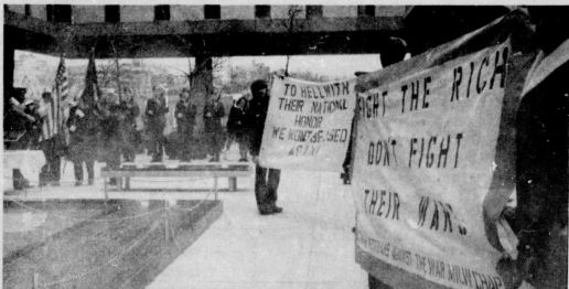
Milwaukee VVAW Chapter at the American Legion ceremony on Vets Day.

stepped off, marching to the "Eternal Flame" and laying a ceremonial wreath (carrying the motto "We Won't Forget, We Won't Forgive") at the Flame to hold a ceremony which actually honored our comrades who had died in the service of the rich. Veterans spoke to how we were used once and then thrown away; they spoke in anger about how we will not forgive the rich who used us--that criminal class which needs wars to increase their rotten profits. A member of Youth in