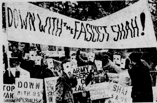
Iranian students demonstrating against the Shah in Washington, DC

The second reason Carter needs the Shah is as a military ally. The U.S., and the Soviet Union are contending for world