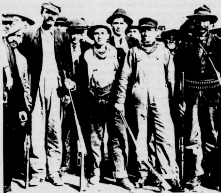
AFTER LUDLOW MASSACRE, MINERS, SOME FROM NEARBY STATES, FORMED ARMED SELF-DEFENSE UNITS TO SEEK REVENGE.

Rarely do we get records or any music that accurately reflects the feelings and aspirations of working people in this country. In the field of country & western music we occasionally get a song like "Coal Miner's Daughter" by Loretta Lynn--a proud song. But, at the same time she puts out trash like "They Don't Make Men Like My