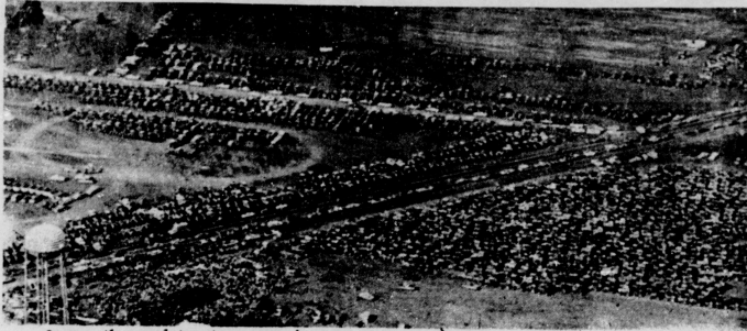
Over a thousand tractors mass in protest near Plains, Georgia--farmers and their families demand a way out from rising prices while their pay gets lower and lower.

U.S. farmers are on the move. Beginning in Colorado, where banks expect 30% of the state's farms to go bankrupt this year alone, the American Agriculture Movement (AAM) has grown and spread to nearly every state in the union. This movement was highlighted late in November when 20,000 farms and family members demonstrated in Plains, Ga., driving through town on 10,000 tractors. Similar large demonstrations were held the same day in other parts of the country.