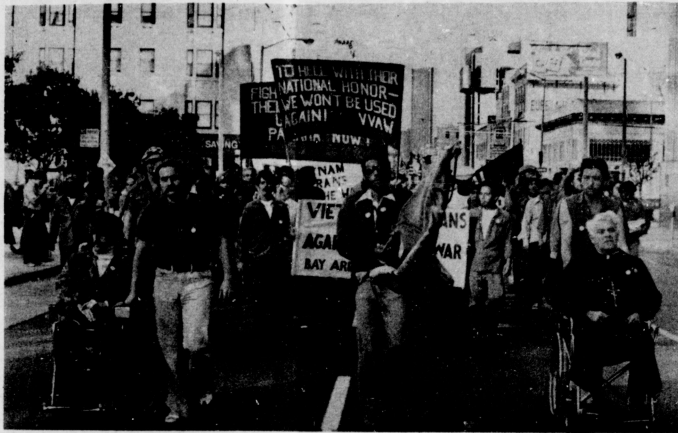
Front of VVAW contingent during Vets Day Parade in San Francisco

Across the country Veterans Day was a real triumph. Though VVAW held activities in only 8 cities (in addition to those with articles on this page, actions took place in New York City, Cin-