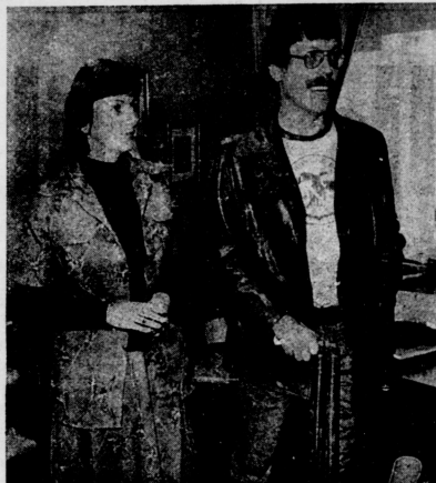
Ex green-beret mercenary back from Rhodesia with fiancée. His legs were blown off by a guerrilla land mine. TOO BAD HE WASN'T STANDING ON HIS HEAD!

The democracy and freedom these soldiers of fortune are defending is the democracy of the white ruling class to decide how it wants to spend its