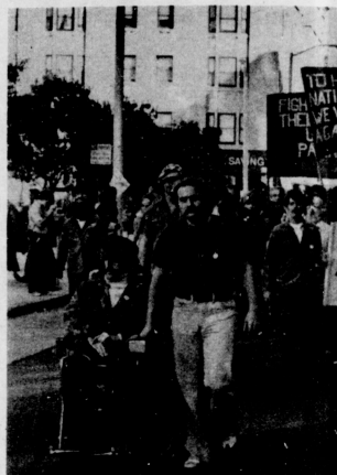
Front of VVAW contingent during

Across the country Veterans Day was a real triumph. Though WVAW held activities in only 8 cities (in addition to those with articles on this page, actions took place in New York City, Cin-