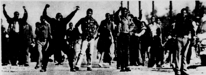
South African students display their anger after their Catholic services are disrupted by police.

New outbursts of rebellion exploded in South Africa on October 20th in the wake of the latest moves by the racist regime of Prime Minister Jon Vorster to crush Black resistance to apartheid and white minority rule. On November 10, police arrested 626 Blacks including 198 schoolchildren in a house-to-house sweep near Pretoria. At the inquest into the murder of Black leader Steve Biko, the police were found "innocent" of any wrongdoing. After watching this farce, angry demonstrators protested in front of the courthouse, taking their lives in their hands. A few days later Biko's family was arrested for distributing literature, the same charge he had been imprisoned on. As of the 11th of November there were more than 300,000 Black students boycotting classes in protest.