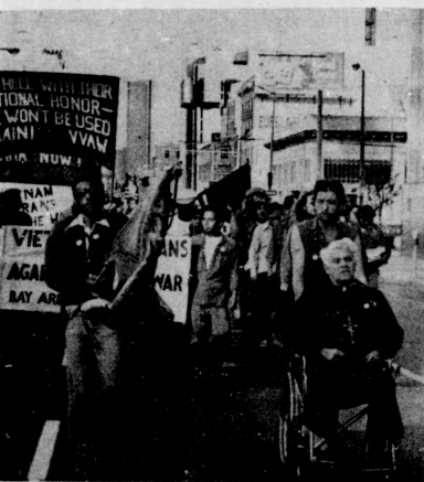
ing Vets Day Parade in San Francisco

from VVAW chapters in Diego and Los Angeles ar-; we put out a call for vets Bay Area to assemble at and Market (in San Fran-) to join us. As the time eached, vets wearing their attle fatigues, some with ls and campaign ribbons, ast three World War II vets, an War vets and Vietnam gathered for a short rally., moving out five abreast, arched 70 strong to the of the parade six blocks . (By the time we were to the Reviewing Stand, we d number 100 strong!) We ed by high school drill s and marching bands, cadets and the glaring of parade officials.