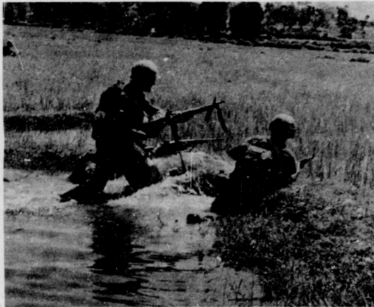
American GIs set up machinegun position at the edge of rice paddy in the northern (I Corps) section of South Vietnam. This is the kind of open territory that the Brigade Commander wanted the Battalion in the article to charge through.

were looking for the Vietnamese before they could reach Da Nang proper. We found them--or they found us--as we reached the halfway mark of an open rice paddy area about 100 yards wide.