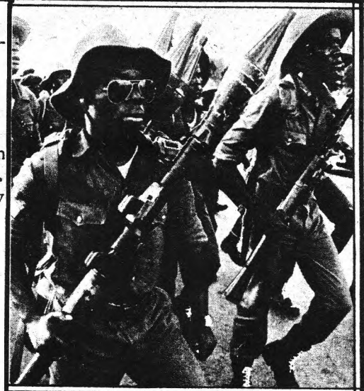
HEROIC M.P.L.A. FIGHTERS

ist revolution, a similar system of extreme capitalist exploitation existed. For instance in the city of Soochow, there was only one childcare center for the capitalists and another for managers of a factory. Today