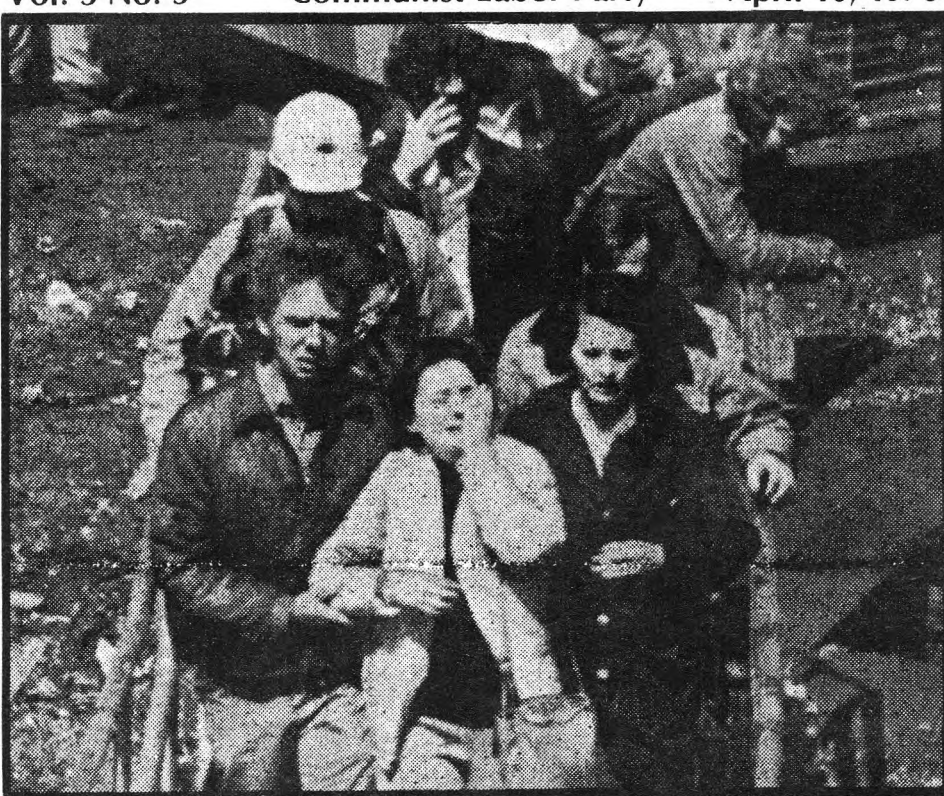
Families and co-workers of murdered miners at Kentucky disaster site.