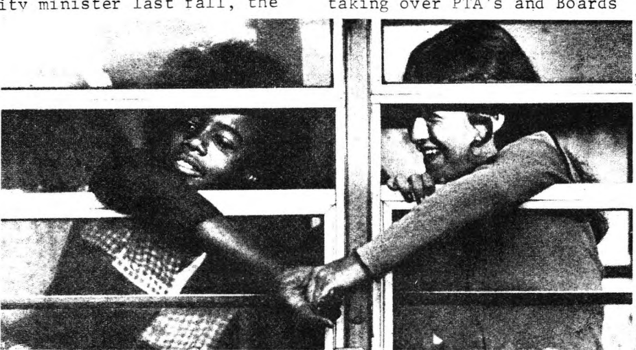
SCHOOLCHILDREN ENJOYING THE RIDE DURING BOSTON'S BUSING CRISIS LAST FALL

The John Birch Society has its western headquarters in San Marino, a wealthy suburb that borders on Pasadena. In league with the Nazi Party who carried out a mock lynching of a Negro national minority minister last fall, the