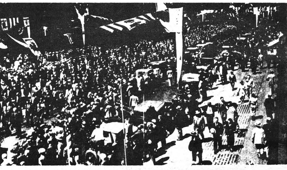
26. Part of the 25,000 unionists who marched silently up Market Street, San Francisco. July 1934, behind the coffins of the two workers killed on "Bloody Thursday." The mayor, governor, police, and employers believed at first that they had broken the back of the union that day by finally moving freight from the docks. They were confronted, however, with a general strike of all San Francisco workers and finally had to yield to most of the longshoremen's and maritime workers' demands.

Proposition E, designed by the Board of Supervisors for the June ballot, would outlaw strikes by city workers. Any city worker who went on strike would be fired! The basic right to strike is one of the main defenses of the working class against the constant drive of the capitalist class to sink us ever deeper into poverty. This amendment must not pass! If strikes can be outlawed for city workers, how long will it be before all of us will lose this basic right of labor? This is a fascist law! Only fascists outlaw strikes and protests. And this is exactly what is happening. Because of the economic crisis, the bourgeoisie is preparing for war -$113 billion for war - war against the socialist countries. We can be sure Kissinger isn't