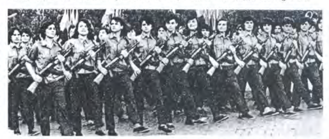
Albanian youth, ready to defend their socialist country, march in anniversary celebrations

as we start on the angular to smash British Imperialism. Long live the People's Republic of Albania! Long live the revolutionary friendship of the Albanian and British working class!