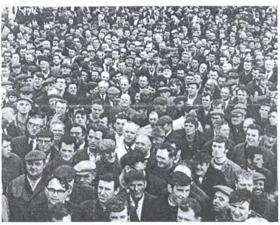
Workers all over Britain, like this mass meeting of dockers at Liverpool during the July dock strike, will now be involved in the fight to defeat anti-trade union legislation.

We will have no such 'leaders' betraying the struggle before it even begins. We consider a 'token strike' as calling for the most timid response from the working class, showing no confidence in their courage and tenacity.