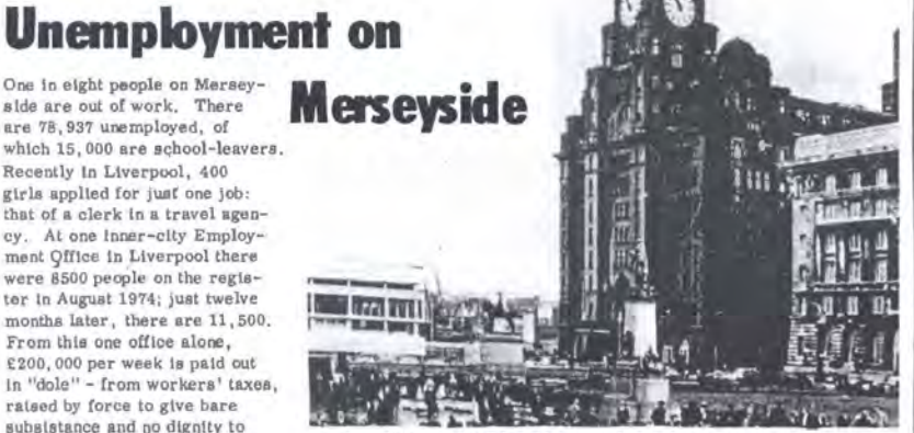
Liverpool dock area at the time of the 1970 strike.

The problem of unemployment stems not from govern ments, whether Labour, Tory, Liberal or even coalition Remember Labour's horror when the "Million Mark" was reached in 1972 when the Tortes held Parliament? Now the total unemployed is 11 million. Unemployment is a weapon of capitalism. Employers on Merseyside have been ruthlessly cutting back on numbers employed for years: two-thirds of the labour force in shipbuilding has been lost; onequarter of the electrical engineering trade; while the Port of Liverpool has 'lost' over half its labour force and miles of dockland in Liverpool is unused and rotting. Yet the cry from the bosses is that workers must be lost because there are too many of them, and demand for the things they produce la insufficient: e.g. Thorn TV tubes; Courtaulds; the CEGB, who are threatening to close Clarence Dock power station; Ford; Vauxhall, who conned 2000 workers into vóluntary redundancy and even then put the remainder on short time; and Triumph. Another bosses' lament is that there are too many workers and they're not working hard enough, or striking too often this bleat comes from Cammell