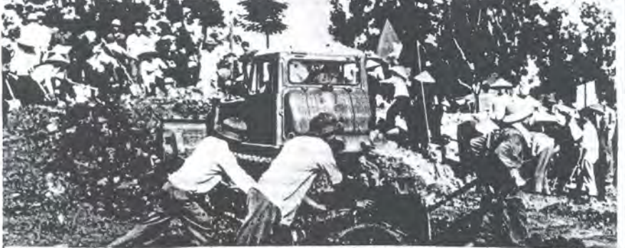
Picture shows Vietnamese youth rebuilding Bac Giang city in North Vietnam. The United States reneged on their promise to assist in the rebuilding of the country they attempted to destroy .

All sections of the population have been involved and Thieu is losing even the closest of his supporters. As the statement says, "the conditions of the people in the Salgon-held areas are more miserable than ever, Millions of people have been herded into concentration camps; hundreds of thousands of political prisoners are being detained in the US-Saigon tails: taxes and rents are much heavier; prices are on the increase; life is more difficult, unemployment more serious, and poverty and starvation are seen everywhere; US weapons, ammunition and war