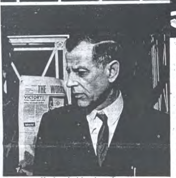
Marxism - Leninism shows the way

The same leadership which consolidated the strength of the AUEW in the all out fight to smash the Industrial Relations Act has been closely involved in major action by workers at Fords to tear the social contract to shreds