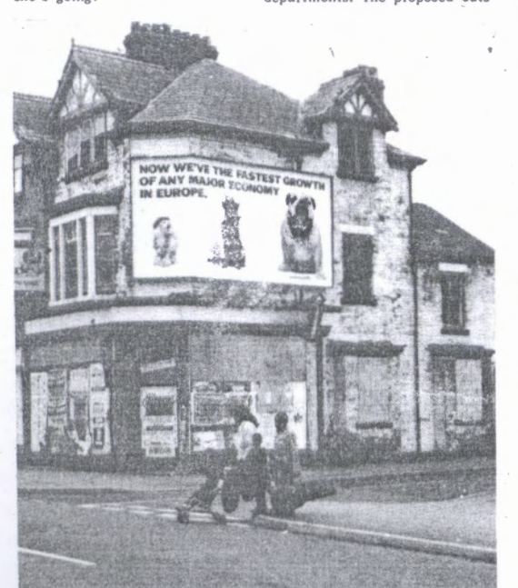
Manchester street scene.

with better timing! The figures for job losses were announced to the unions in April and the cuts will affect all regions and all departments. The proposed cuts