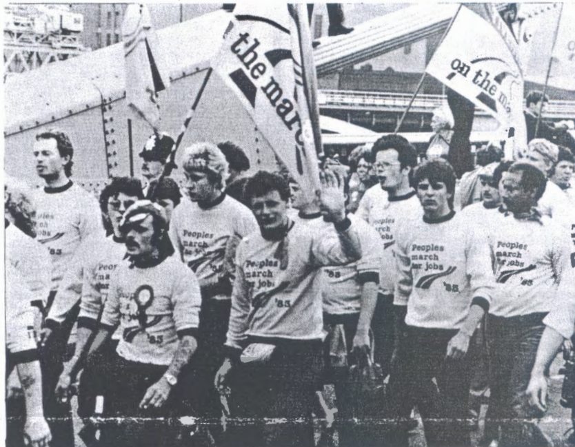
The March for Jobs will go on gaining support from employed and unemployed until it becomes an army investing No. 10.

Thatcher spat in the face of the working class and many members of the working class voted for Thatcher - or for her allies, the SDP. In Latin America the same goat that leads its kind to the abattoir is called a judas goat. We will not be led to our doom by judas sheep.