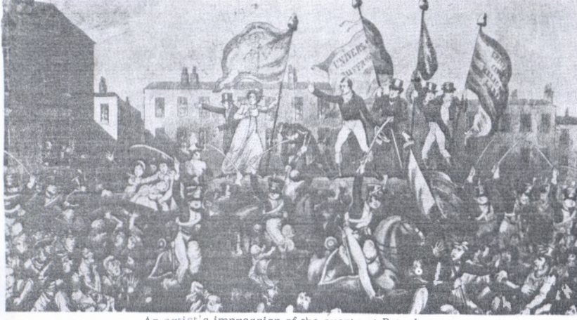
An artist's impression of the events at Peterloo.

DRAWING on a hundred and fifty years of British imperialist experience in Africa, Callaghan, on the occasion of receiving an award from the US National Committee on Foreign Policy, outlined a neo-colonial strategy for the West in continuing to interfere profitably in the affairs of African countries,