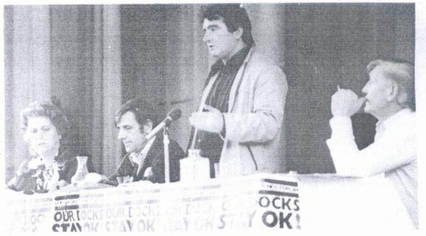
Above: a Newham housewife, a Liverpool docker (speaking) and the secretary of the National Ports Shop Stewards Committee address a packed meeting to prevent the closure of London's docks. Below: dock wasteland in London.

If the pamphlet has faults they are born out of a real desire to win at all costs. and perhaps take short cuts: at times it seems as though the long established trade union machinery is regarded as useless, rather than those involved dedicating themselves to using it as a major weapon in the struggle. Also, no pamphlet, drawing the lessons from a particular period and type of working class action, can tell the whole story the battle is continuing and the experiences of each part adds a wealth of knowledge and lessons for those involved and those yet to join in. And it is this knowledge and experience which will enable our class to go forward from defending against capitalism to destroying its enemy. Only then will we be able to write a new pamphlet describing a secure, forward looking, expanding health service under real workers' control - Socialism.