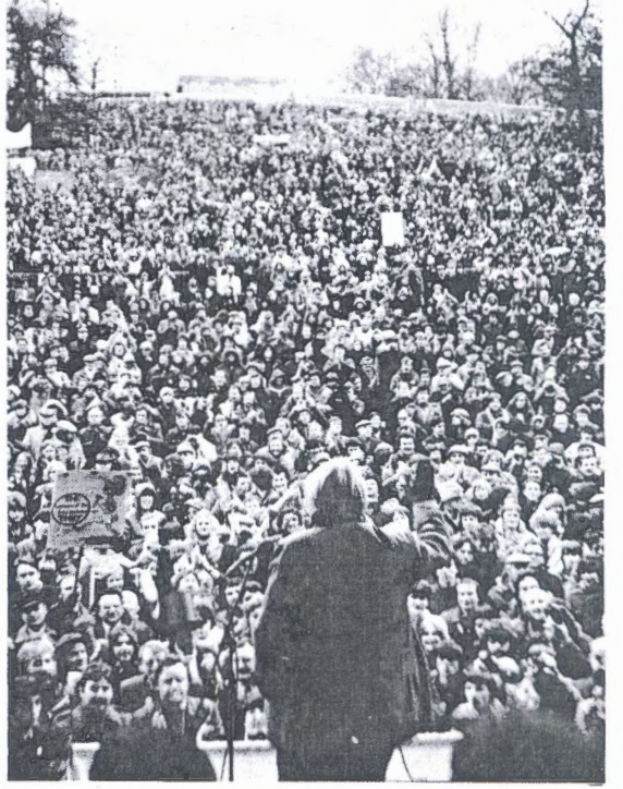
A DEMONSTRATION in Glasgow in February of this year against the level of unemployment in Britain.