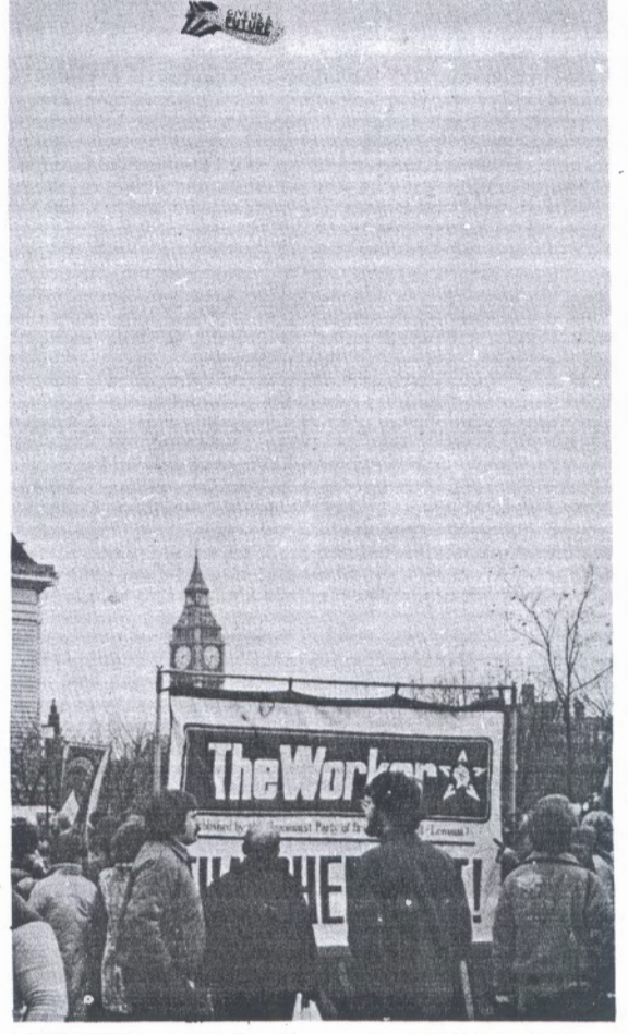
A MINIATURE barrage balloon flies over County Hall in London during the recent TUC March for Youth. The GLC will need more than such balloons to protect London from a Government more destructive than the Luftwaffe of World War Two.

The taxpayer alone will have to find the £1 billion to finance what is a compulsory year's sentence in a not-soopen prison, for each of the unemployed school leavers.