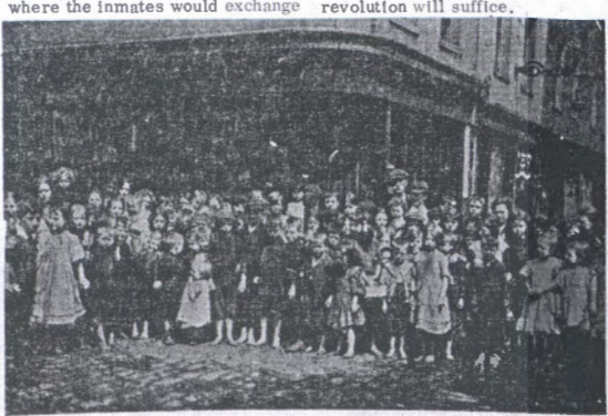
London's poor in the streets of East London

Today, when we hear the arguments of those like Eysenck, Jensen or the National Front about the more oppressed of our class, we have only to think of the struggle for dignity of the London poor to see how false they are. Last time a war was one of the 'solutions' to the problem; now only revolution will suffice.