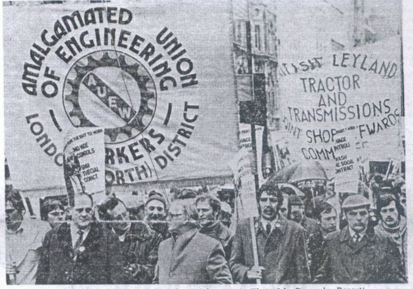
Leyland workers in action last year against the social contract.

What is utterly disgraceful is that the Labour Government should back a plan for sacking workers in Merseyside where unemployment is already running at an intolerable 12 per cent. Particularly is this a treacherous act when taxpayers' money has been used for regional development to prevent high unemployment and has also been poured into Leyland. They cut our throats and make us pay for it to be done.