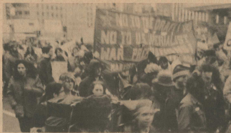
In March and April, mass demonstrations and rallies were held in many cities across the U.S. denouncing both Carter's call for the reintroduction of the draft and the wild and frantic war preparations of the U.S. imperialists. On March 22, braving fierce wind and rain, more than 30,000 people demonstrated in Wash-

The source of war is world imperialism, headed by the U.S. and Soviet superpowers and including revisionist China and the other imperialist states. The U.S. is an imperialist monster, a world exploiter, blackmailer and bully, and a center of international aggression. So long as U.S. imperialism exists, the world will be subjected to its schemes of world domination and the threat of war. The anti-draft movement is fighting against the aggressive plans of U.S. imperialism. Through this movement thousands and thousands of people are being drawn into open conflict with the Carter government. They are being tempered and trained in struggle, and through their own experience they are becoming convinced of the necessity of revolu-