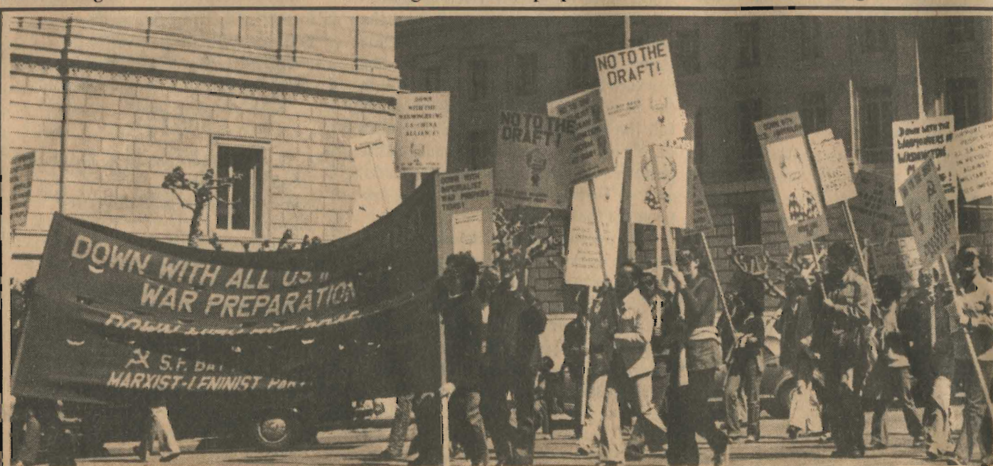
Part of the MLP contingent in a demonstration of 7,000 against the draft in San Francisco.