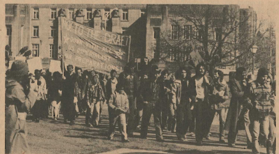
ington, D.C. (left). In Olympia, Washington more than 200 activists held a militant march and rally, shouting the slogans: "Down with the warmongers!" "No to the draft!" and "Down with all imperialist war preparations!" (right)