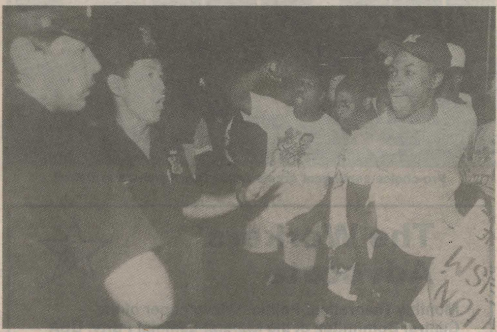
Angry youth confront police at Harpos, September 6