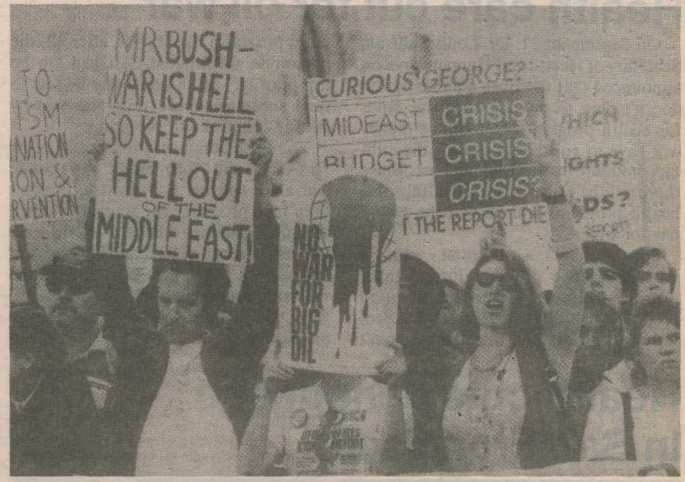
San Francisco protesters denounce Bush for war in the Mideast, Sept. 19

On September 27, Bush flew in to Detroit for another Republican fund-raiser. But here too, two hundred