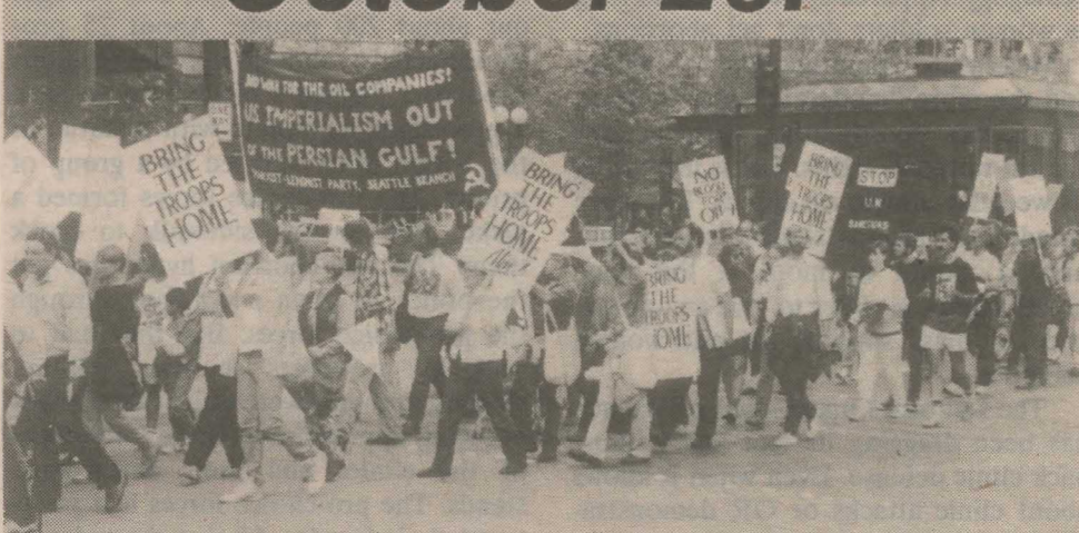
350 marched in Seattle against Persian Gulf war buildup, September 8

special assistant to Air Force Secretary Donald Rice.)