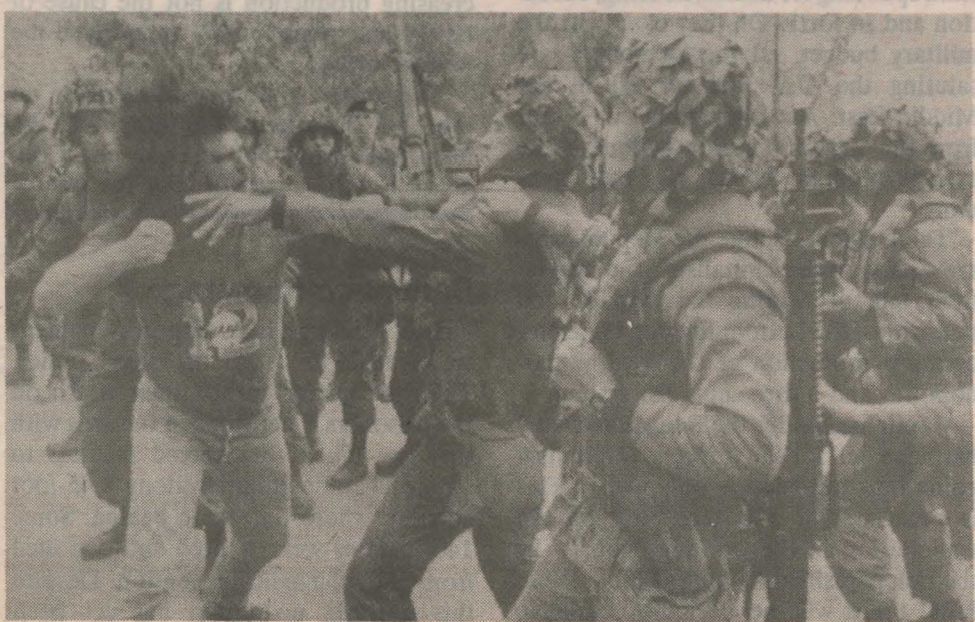
Mohawks battle Canadian troops at the Kahnawake reserve near Montreal

600 Korean workers occupied a munitions plant in Pusan in early September and held it until attacked by 3,000 paramilitary police. The police attacked them with tear gas. The workers responded with rocks and firebombs but were forced