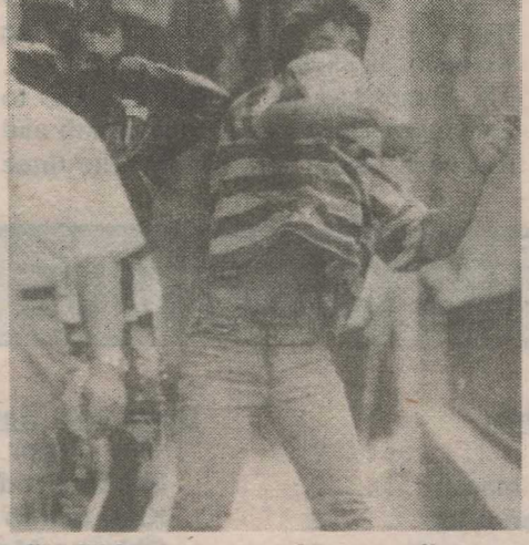
Madrid protest against sending Spanish warships to Persian Gulf

The social democratic government of Spain has sent three warships to the Gulf. These are largely manned by draftee sailors. The government has acted in defiance of public spinion which is strong against intervention. On Septem-