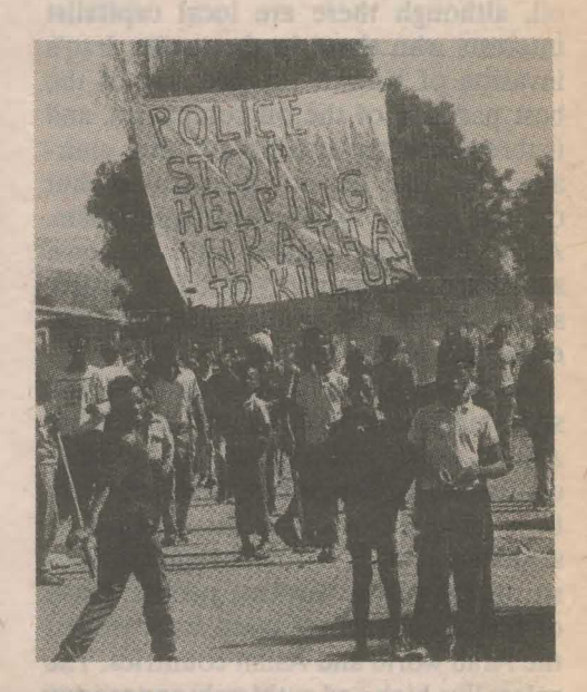
S. African masses denounce police-backed terror campaign