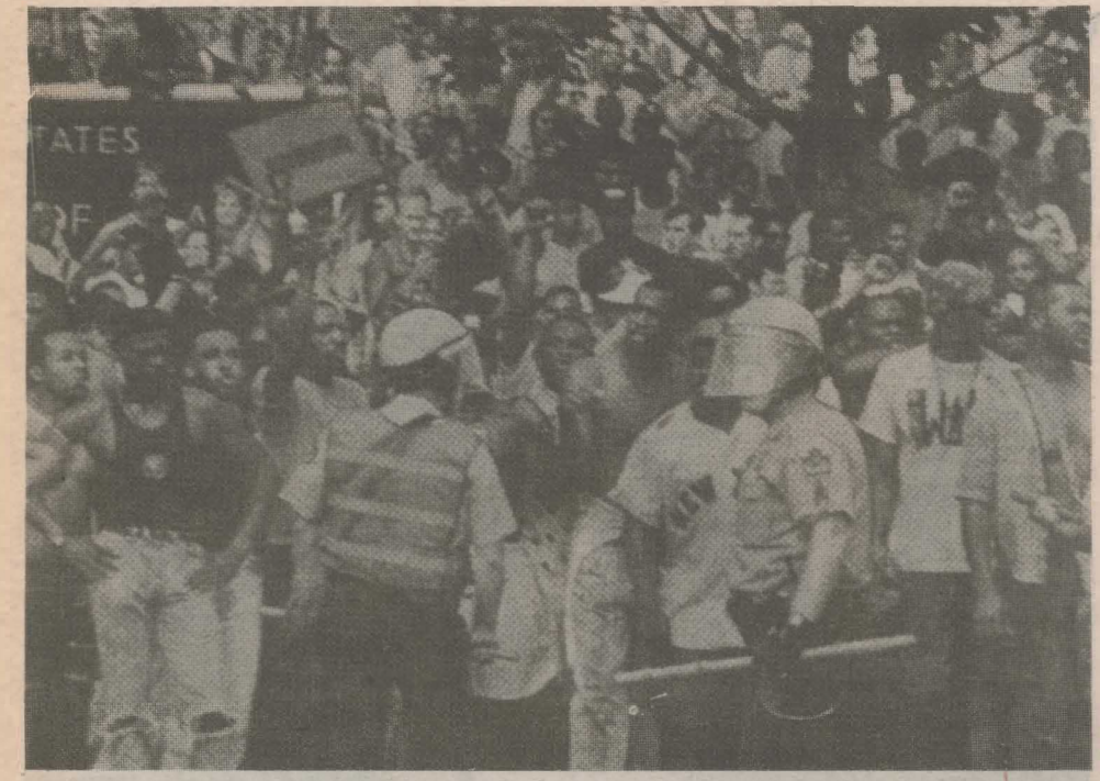
Anti-racists in Washington, D.C. jeer police protecting the Klan

Thousands of protesters came out September 2 to stop the Ku Klux Klan from marching through Washington D.C.