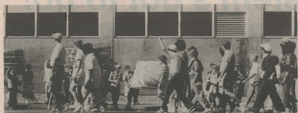
Pro-choice contingent greets Labor Day marchers in Detroit