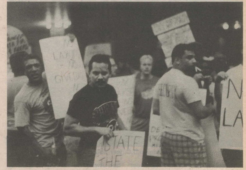
Rank-and-file NYC transit workers picket

(Based on Sept. 1 "New York Workers' Voice," paper of MLP-New York.)