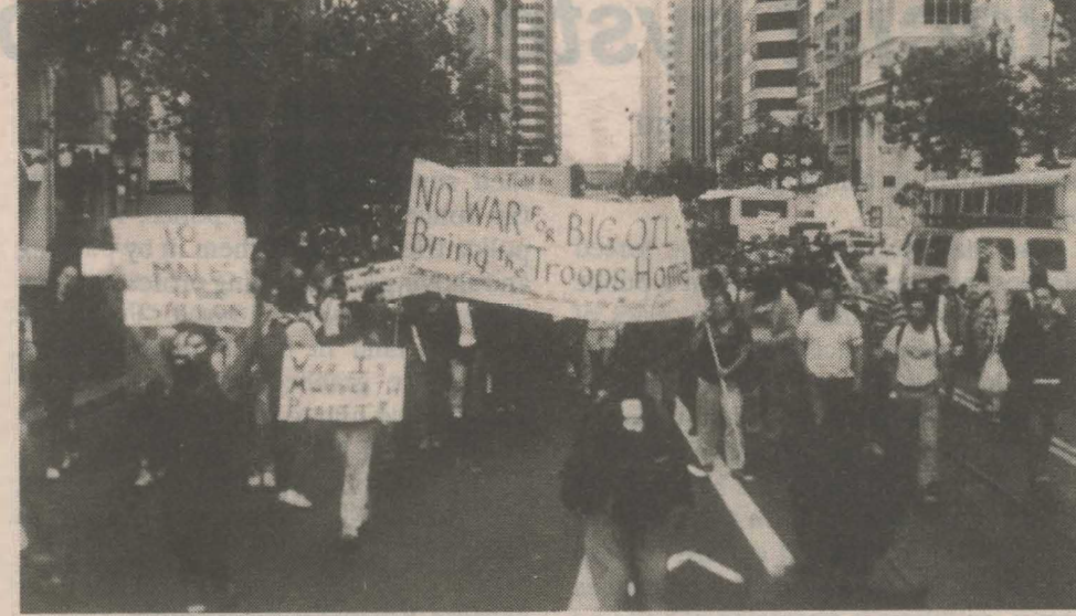
700 marchers in San Francisco rally against Chevron oil and news media

Today, in the Persian Gulf, UN diplomacy isn't an alternative to military force but a complement to it. It is UN resolutions on embargoing Iraq that the U.S. forces are claiming to be upholding. One cannot forget that on August 25, the U.S. succeeded in getting the Security Council to vote (13-0, Cuba and Yemen abstain-