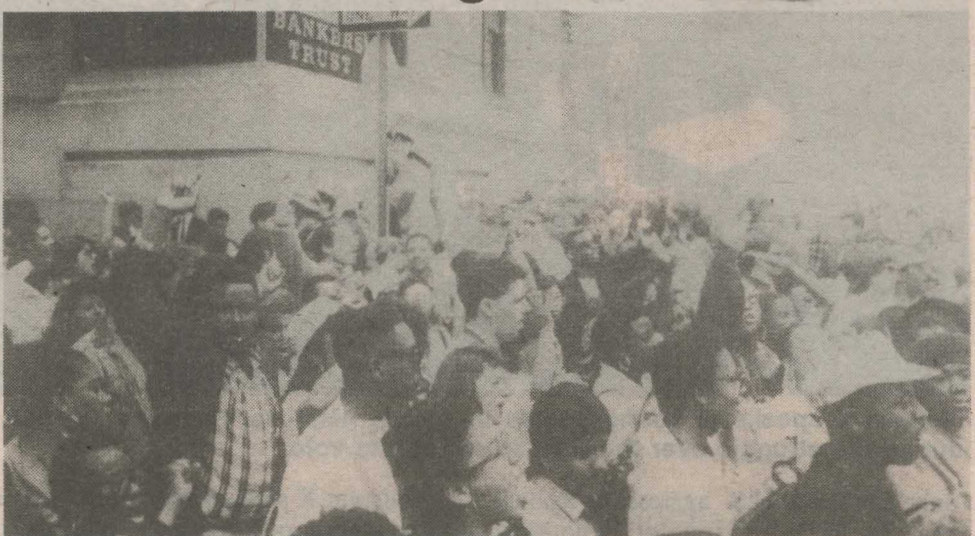
CUNY students demonstrate in Manhattan against tuition hikes.

Last year students at the City University of New York (CUNY) rose up at 17 campuses to defeat budget cuts and a $200-a-year increase in tultion. Buildings were seized at 13 colleges, and 10,000 students and staff took part in an 11hour protest march and rally.