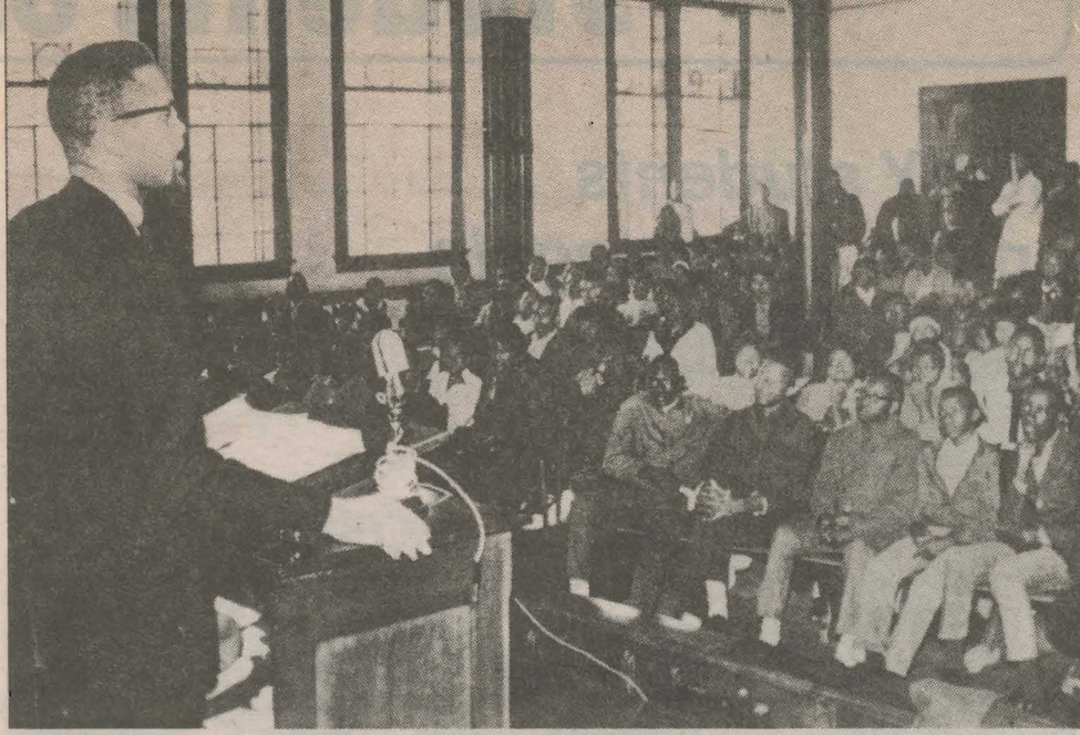
Malcom X speaks to young people in Selma, Alabama, February 4, 1965, during the struggle over the right to register to vote.

only condemn U.S. aggression against Vietnam, but to also support the national liberation struggle of the Vietnamese people. He also supported other liberation struggles in Asia and Latin America. And he emphasized the importance of the anti-colonial revolutions that were then shaking Africa.