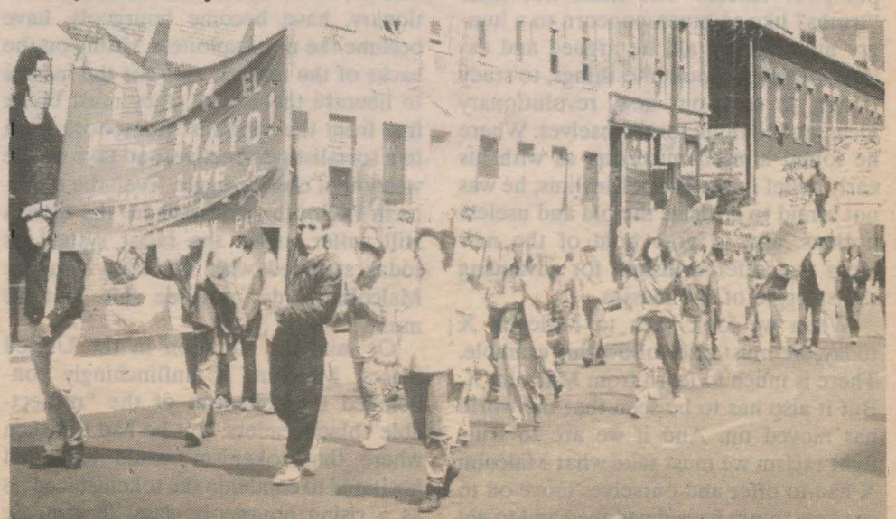
International Workers' Day march in Chicago organized by the Markist-Leninist Party, USA