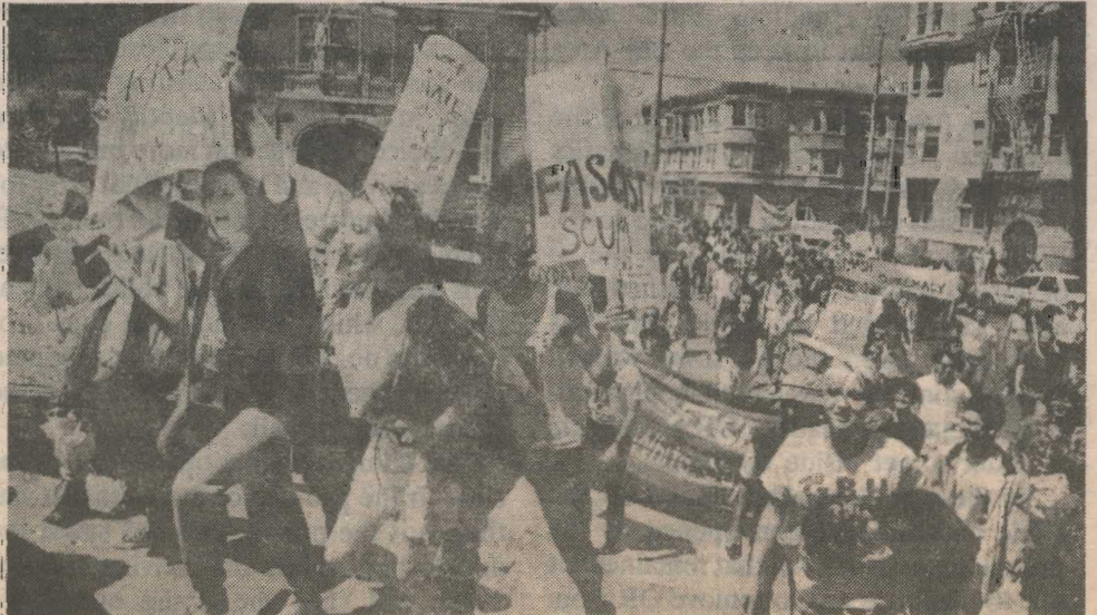
Demonstration against nacist skinheads winds its way through Haight Ashbury district of San Francisco.

"Innocent antil proven black," that's the headline on an article in the May 19th issue of the Chicago Workers' Woice. It describes a series of recent racist shootings and murders by the Chicago police it reports that 200 people marched against police torture and brutality on May 13.