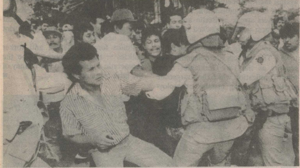
Striking public sector workers in Nicaragua resist attacks by the police. Sandinista police are now serving Chamorro.

The Sandinista leaders have made themselves junior partners in the new capitalist regime. If the masses are to defend themselves, they will have to fight their way free of the Sandinista influence, and organize an independent move-