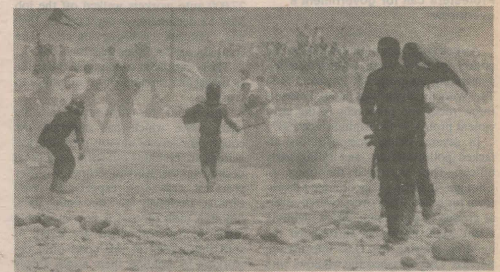
Jordanian troops attack a Palestinian solidarity march trying to enter Israeli-occupied West Bank.