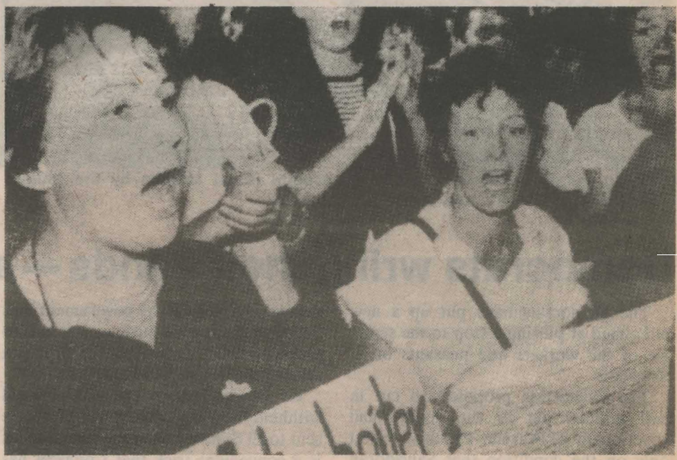
East German teachers demonstrate in Berlin to demand job security.

Police force to defend anti-worker policies — this is supposed to be the democratic alternative to the tyranny of the false communists?