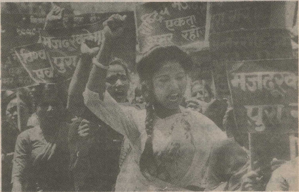
Women march in Katmandu in what's reported to be the first May Day rally in Nepal's history.