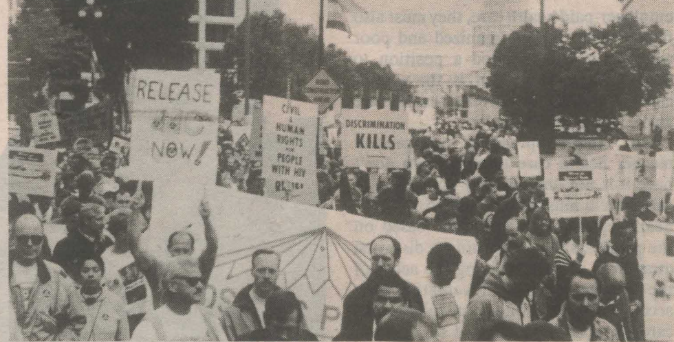
15,000 people march through San Francisco demanding action on AIDS,

Friday saw an action by the ACT-UP women's caucus, which targeted the lack