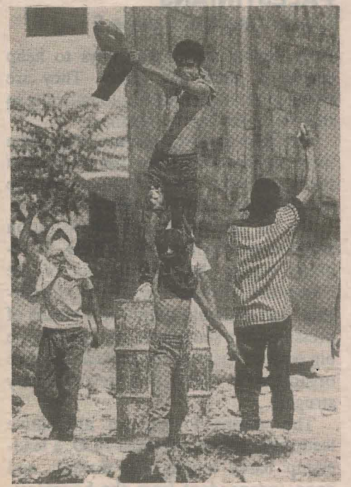
Palestinian youth defy Israeli bullets with sticks and stones.

The Bush administration has just cut off talks with the PLO. These talks were never intended to gain freedom for the Palestinians; they were meant to cool down the Palestinian uprising by giving the appearance of U.S. concern for the Palestinian plight. U.S. policy has always