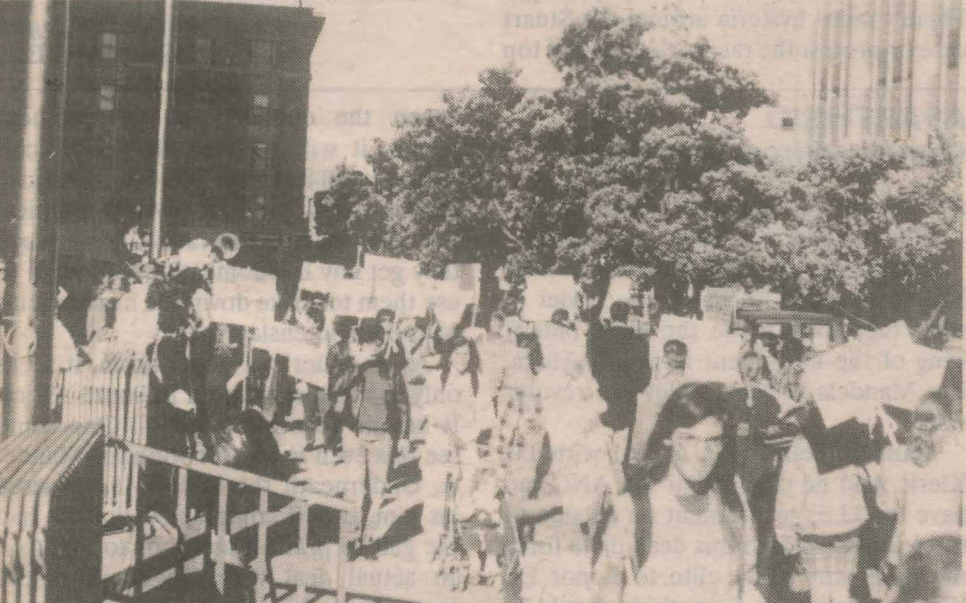
San Francisco pro-choice activists denounce Supreme Court ruling on parental notification.

The bringing of abusive pressure on the girl is, in fact, the real idea behind such laws, as the requirement of notifying both parents in the Minnesota law clearly shows. The girl not only has to notify a parent, and do it prior to the abortion,