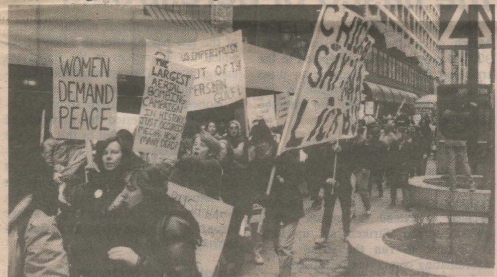
Women's Day march in Chicago condemns the U.S. massacre in Iraq

Two weeks later, 15 pro-choice demonstrators squared off against the antiabortionists on March 23. There was a lot of pushing and shoving, especially when the antiabortion bullies tried to stop patients from entering the clinic. Frustrated by opposition, the holy bullies didn't appeal to the spirit but again called on the notorious Chicago police, and sought to have them arrest prochoice people. In the midst of the resulting charges and counter-charges, two pro-choice activists and one anti-choice were arrested.