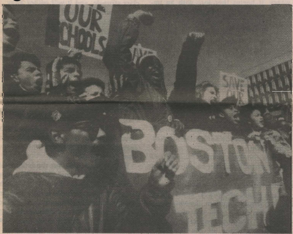
Thousands of students rally at Boston City Hall against cuts in education

Morethan 1,500 parents, teachers, and students in the Boston public schools themoustrated March 9 in downtown Boston. They protested Mayou Flynn's 348 million slash in the school budget and his plans for further cuts in the wake of state embacks by Governor Weld. Flynn's program will lead to layoffs of hundreds of teachers, the expansion of class size to over 30 students to a class-room, and the elimination of after school sports and other programs. Fight school students protested again on March 15.