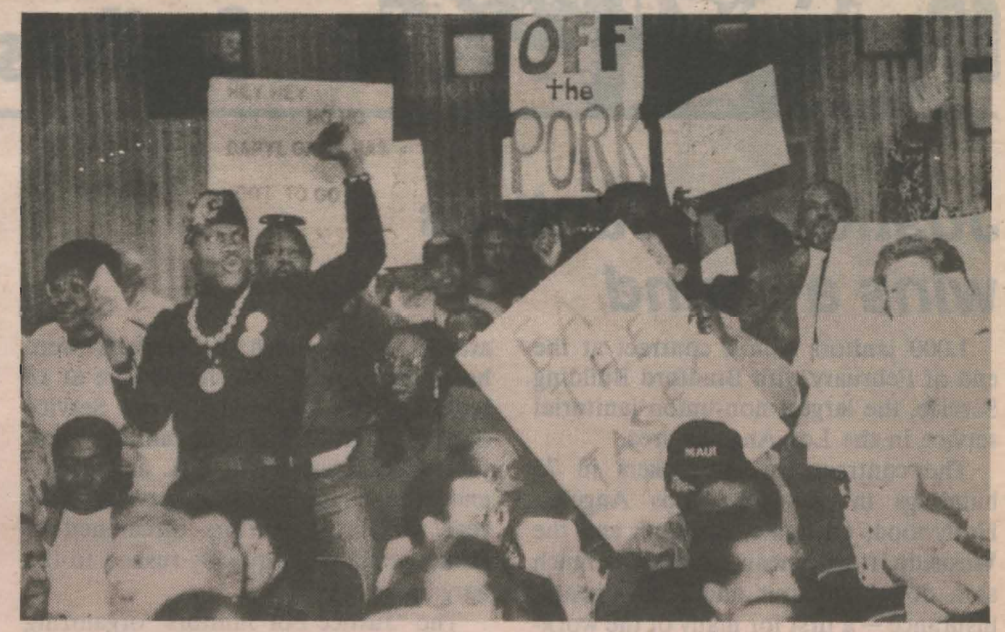
Protesters shout in anger at L.A. Police Commission hearing

being systematically organized from the White House and Supreme Court down through the local governments. It is an essential part of the U.S. establishment.