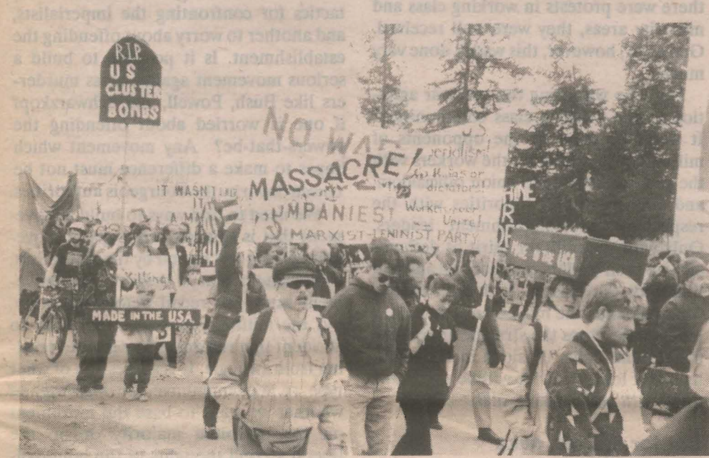
March 16 anti-war march at Concord Naval Weapons Station, California