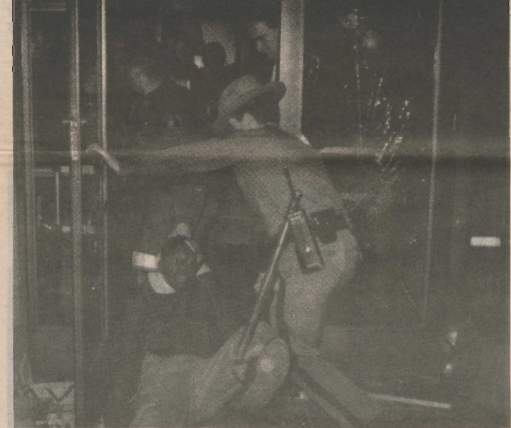
Demonstrators battled state troopers outside Governor Cuomo's office in

(Based in part on a March issue of the 'New York Worker's Voice," paper of the MLP-New York.)