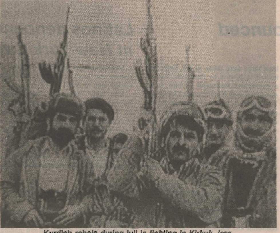
Kurdish rebels during lull in fighting in Kirkuk, Iraq

The forces loyal to Saddam have wrought terrible destruction on rebel areas in the southern cities, especially Basra. The army demolished entire neighborhoods with tank fire, artillery, and helicopter gunships. Pro-Saddam troops dropped napalm on rebei positions and also, reportedly, used poisongas grenades. Captured rebels are massacred in mass executions, their bodies left in the streets to intimidate the popula-