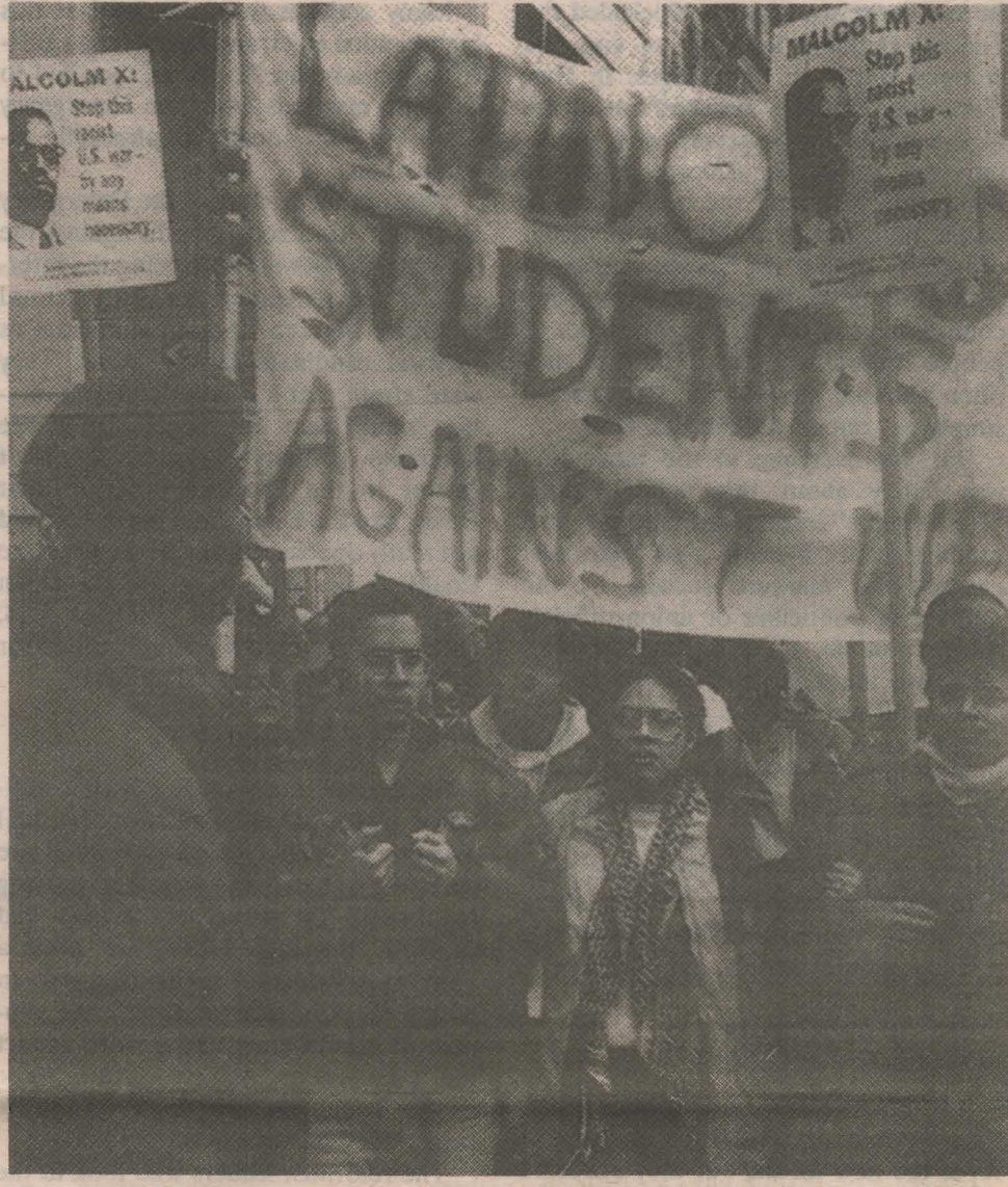
New York City students demonstrate against the Persian Gulf War, Feb.21

campaign aimed at military recruitment in the schools. In early March they held a protest at the recruiting center on 66th Street, which is opposite two high schools, and they beat buckets and distributed an anti-war leaflet. Later in the month some of these high school activists joined a protest of 100 in support of people arrested in earlier actions.