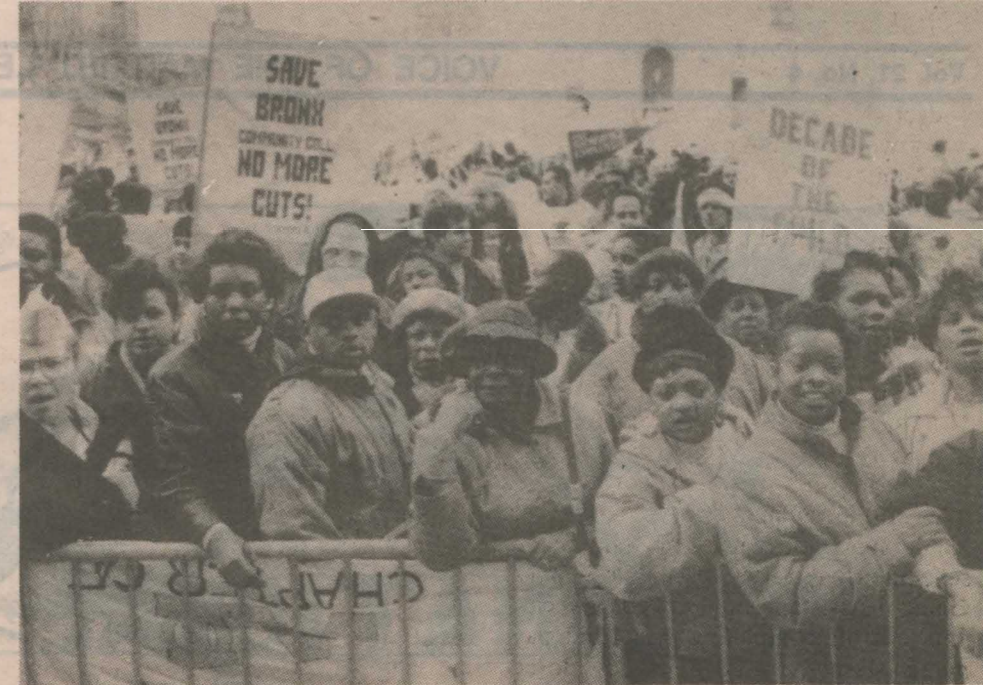
20,000 workers and students protested in Albany against N.Y. state budget cuts

While Cuomo and co. have been denouncing Reaganite cutbacks in Washington, they themselves have been rolling back state taxes on the capitalist corporations and the wealthy. Ten years ago taxes on corporations accounted for over 9% of state revenues. Today they are only a little over 5%. Similar rollbacks have occurred for personal incomes in