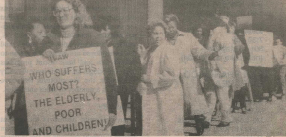
Michigan state employees protest in Detroit against budget cutbacks