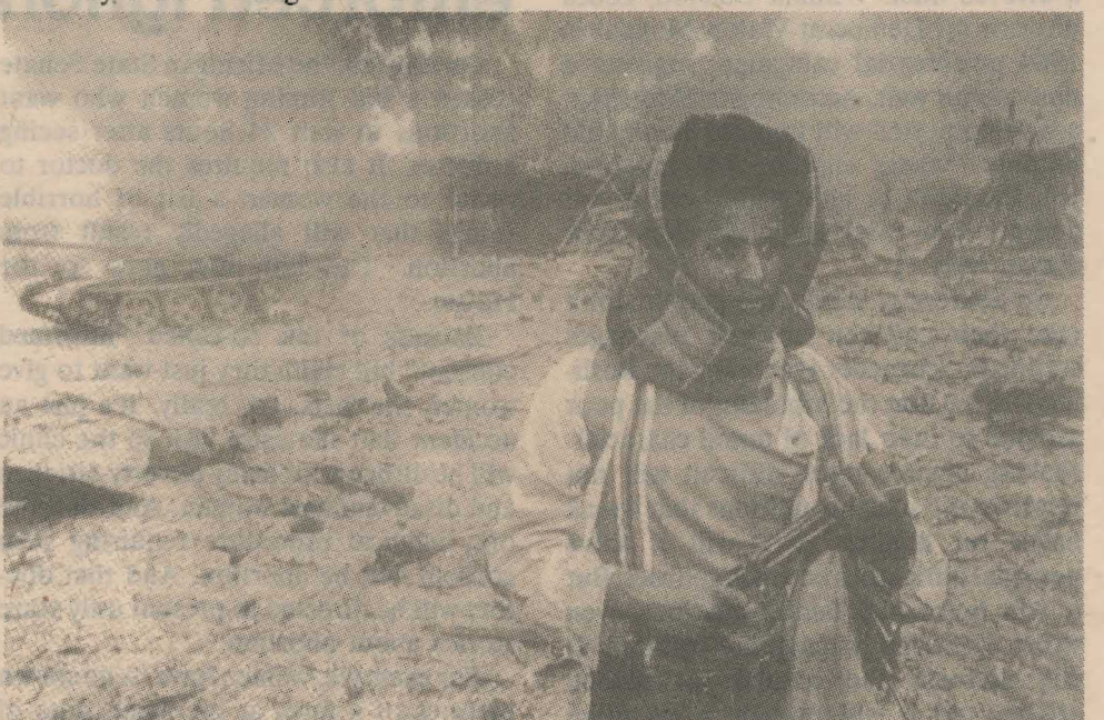
Inside the compound of the presidential palace rebels took on May 28

cratic government will not be easy. In particular, supporters of the old regime and Amhara chauvinists generally are rearing their heads. They are outraged that a Tigrayan-based force has triumphed in Addis Ababa and that Eritrea is free and has been promised a referendum on independence.