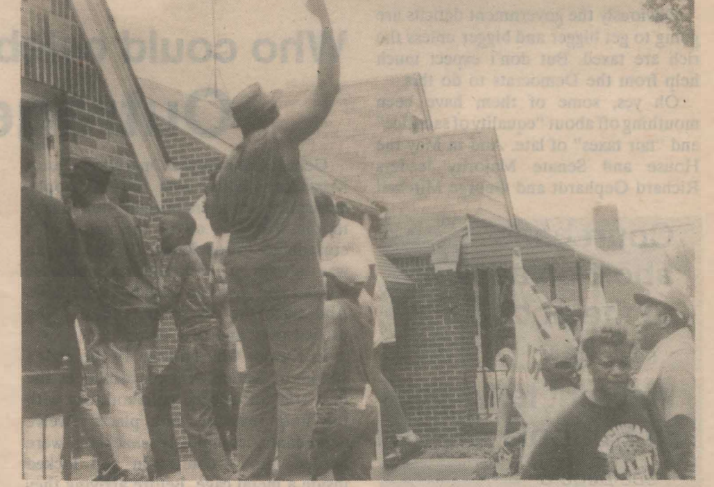
Homeless activists prepare to seize abandoned house