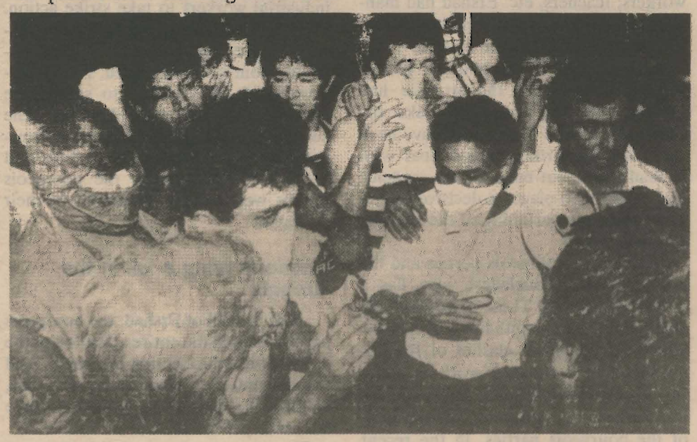
Latino youth regroup during the rebellion in Mount Pleasant

The struggle was not limited to the Latino community, as the national news media tried to portray it. The fighting quickly spread to the black communities neighboring Mount Pleasant. The majority of the people arrested were black. In fact there was also a small number of whites participating in the actions. The rapid spread of the struggle shows the deep anger that is building up against racism and poverty. People are tired of being treated like dogs. More outbursts are inevitable. What is needed is to organize the anger and turn it into a sustained and organized mass movement against the racist system.