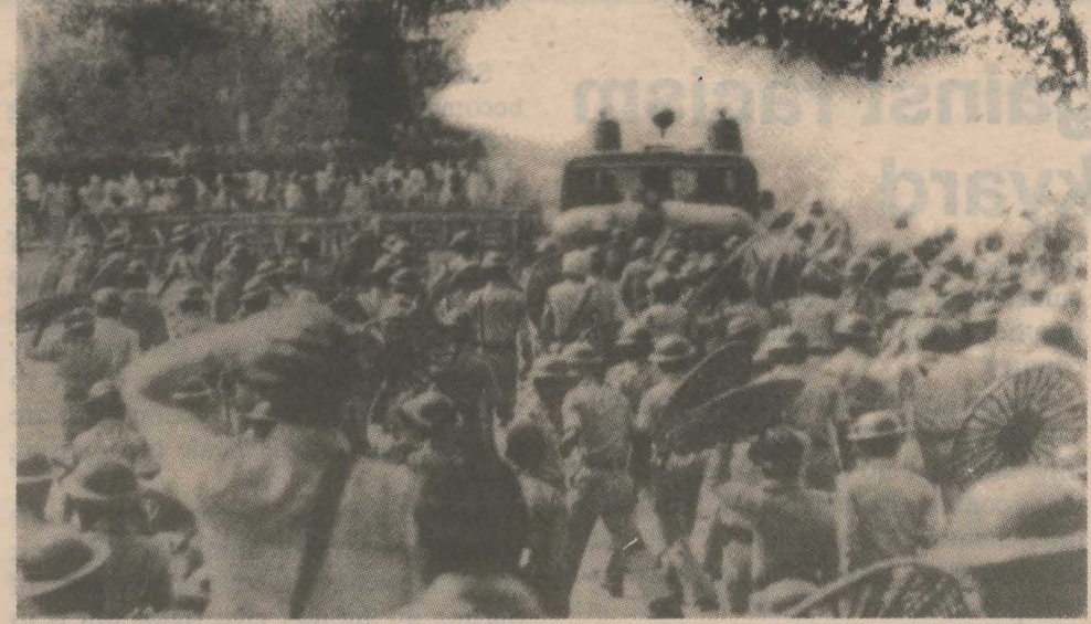
Students face off against police in '83. Campaign against Ershad's education plan marked the start of struggle against his tyranny

Meanwhile, the conditions of the masses grew worse and worse. Despair continued to drive more of the rural poor into the cities, but jobs remained