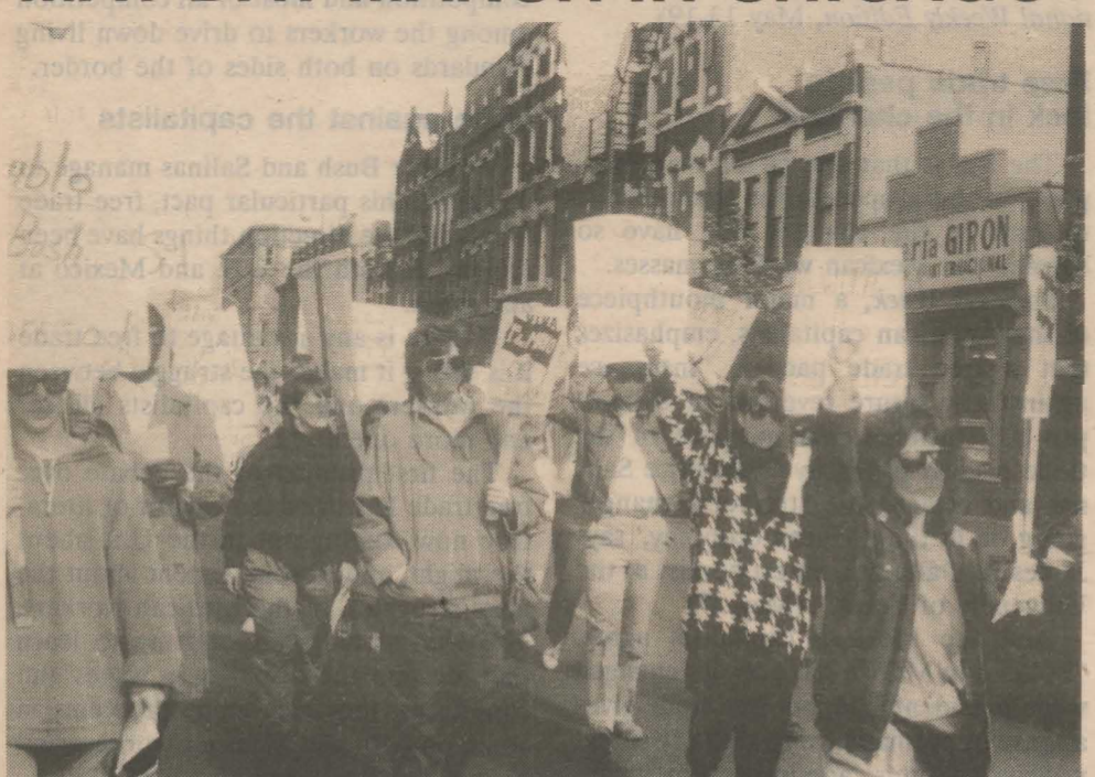
On May 4, activists: marched in Chicago celebrating International Workers' Day. They denounced Bush's "New World Order" and called on workers to take its struggle. The march was organized by the MLP, which also sportsored May Day events in Boston, Seattle and San Francisco.