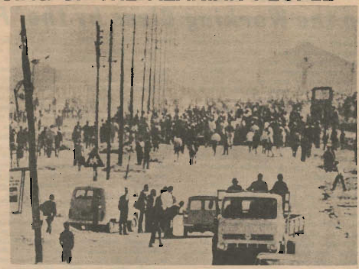
10,000 Azanian people in Soweto rise up in fury against the South African regime.

American history, Puerto Rico, Hawaii, Guam, the southwest of the United States, the oppressed Black nation and others must also be added to your list. The present "sovereign territory" of the U.S. state was seized in aggressive wars, through unequal treaties and treaties between the U.S. and other colonial powers. The U.S. waged a series of genocidal wars against the native Indian inhabitants of America. The U.S. seized Alaska by "buying" it from the Russian Tsar in complete disregard for the local population, the Aleuts and Eskimos. The entire Southwest of the U.S. including California and Texas was robbed from Mexico in a series of aggressive acts culminating in the aggressive Mexican-American war. Puerto Rico, Guam and numerous other islands have been seized as direct colonies of U.S. imperialism. The American workers and other oppressed people who suffer under the savage dictatorship of the U.S. monopoly capitalist class and their state machine are completely opposed to the forcible seizure