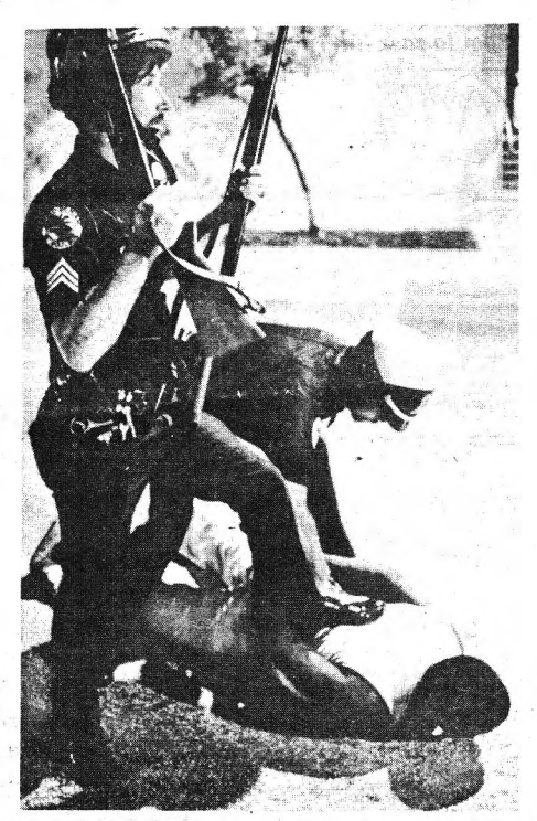
With no reforms left to try to pacify the Afro-American people, the bourgeoisie will have to crush their resistance by brutal force.

things off. And what happened? Andrew Young, Carter's number one Negro, had to admit their impotency. "When someyou can do." But they did do something. What these misleaders did was to try to divert the struggle of the Afro-Americans against the state, the cops and the court into a black and white, black and Cuban issue. Though mainly aimed at the cops, and the state, without communist leadership the spontaneous movement did become anti-white instead of anti-monopoly capitalist as a response to national oppression. During the first night of the rebellion, three whites passing through Liberty City were taken from their cars and beaten to death in a spontaneous outburst of the masses' anger. Fascist scums, the Klan, took the opportunity to nightridding the black community and shot at innocent people, killing three people. These dogs need to be treated like the cops-and shot