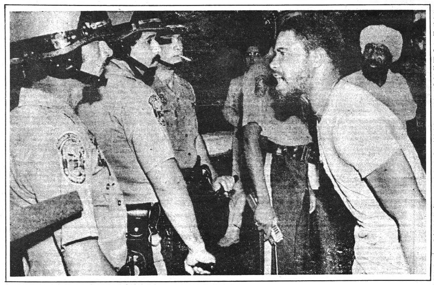
Afro-American worker curses Miami pigs during the night of the rebellion.

The decade has barely begun and Miami is at war. Miami commands the undivided attention of the entire nation, as the fury of the Afro-American people swept through the city like a raging inferno. Miami exploded in the most powerful armed rebellion since the 60's. And Miami is just the beginning, a preview of the class and national struggle to come.