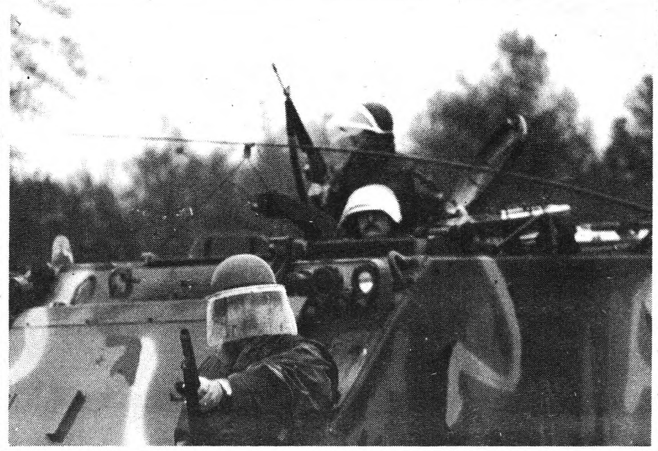
On Nov. 11, in honor of our five comrades murdered by Klan/Nazis/FBI armed funeral marches defied the military might of the state.