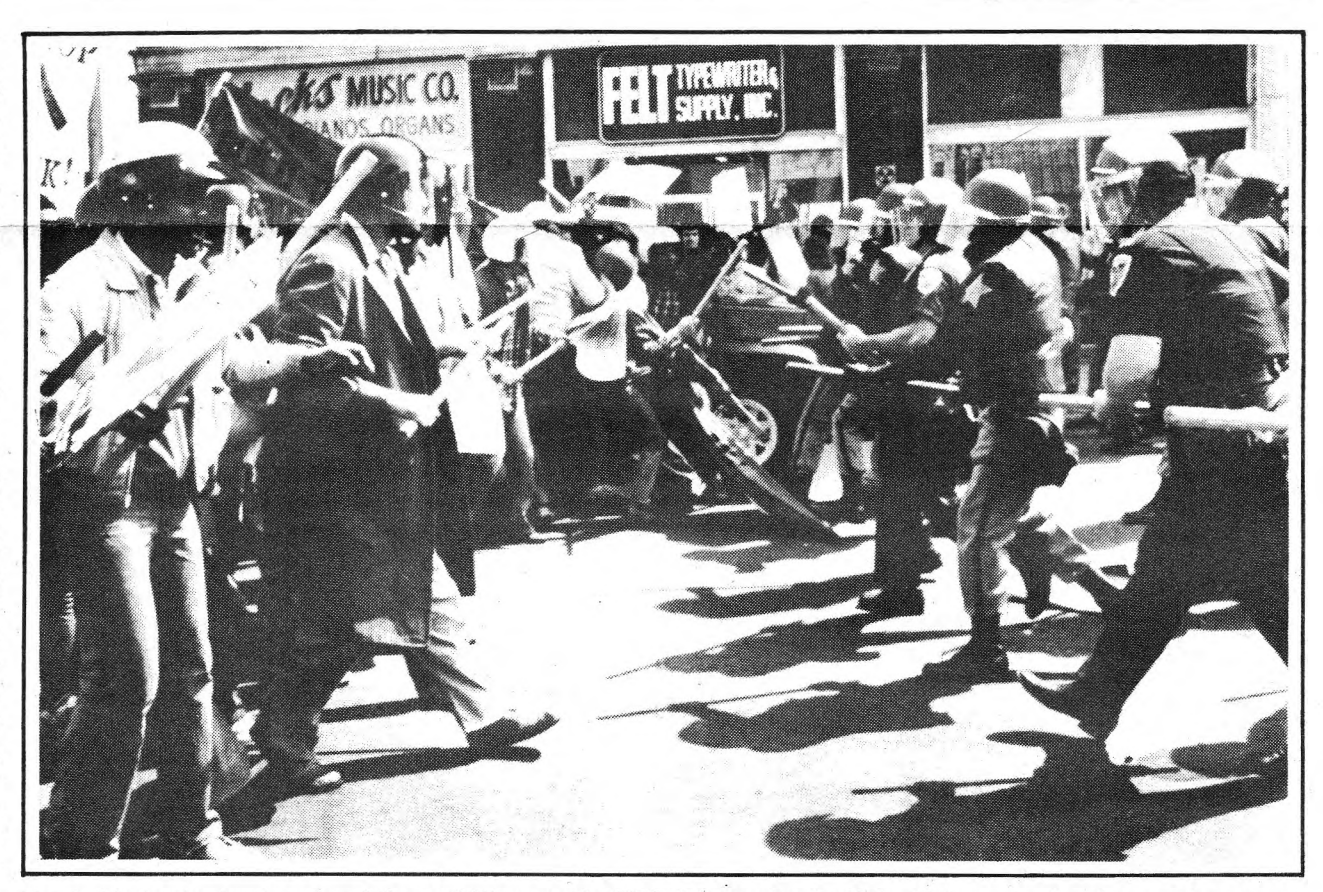
March 26-In the front ranks of the anti-Klan march, CWP fighters stood off the Kokomo police riot squad and protected demonstrators.

preparation for the dictatorship of the proletariat a thousand fold. There is no question that the Afro-American masses will step forward and embrace communism, particularly the CWP on a mass scale in the 80's, as proven at the funeral march for the CWP 5 and on Feb.