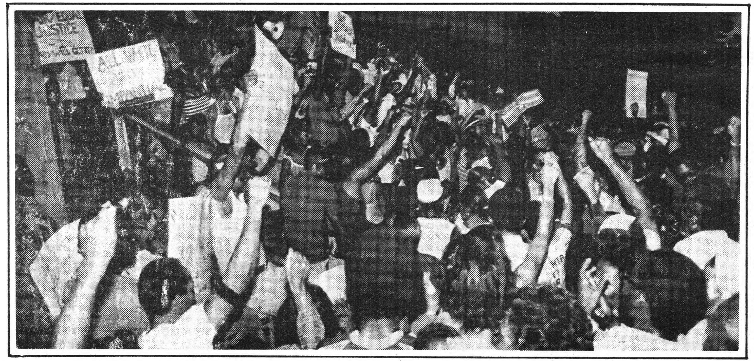
Miami. 5,000 Afro-Americans surround the justice building moments before storming the building.

The revolutionary energy and heroism that theAfro-Americans demonstrated in Miami is not enough to bring down U.S. imperialism. To overthrow the whole capitalist class, the armed struggle must be national in scope, consciously led, and well prepared for. That means 200 hundred million have to be politically educated to, and there must be hundreds of Miami's with one aim-to destroy capitalism. Preparation for that glorious day is what the Communist Workers Party is all about.