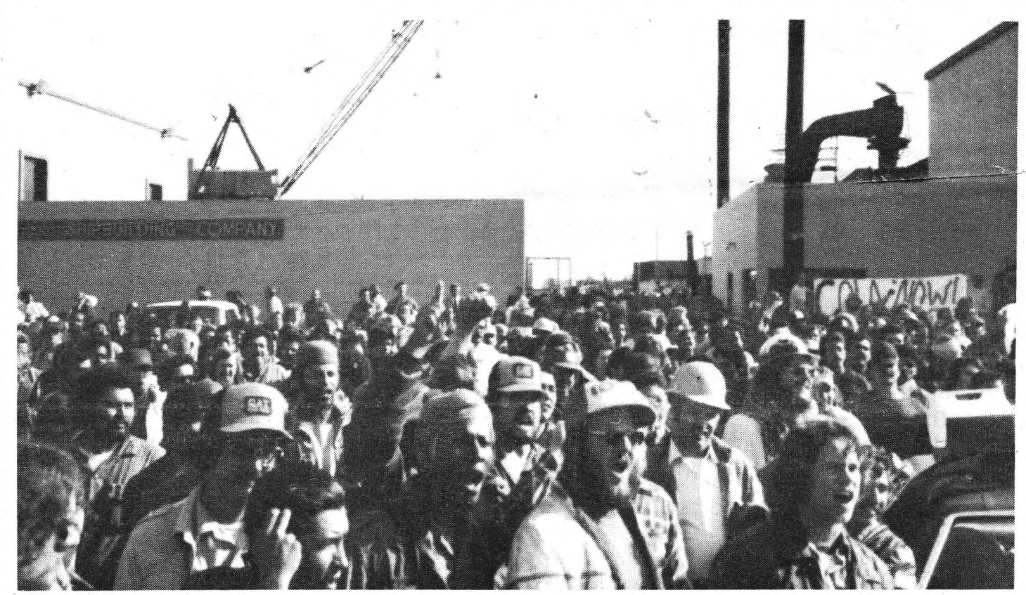
On March 27 Nassco shipyard workers in San Diego flooded the yard for a union rally demanding COLA. On April 1 they followed workers greedy, recently voted himself a up with a sickout by 900 workers, part of a campaign led by CWP supporters.

herent understanding, strategic class confidence and a clear target to the workers. We must explain to the masses why the 80's economic crisis is deeper than the 30's Depression and what this means for the immediate prospects for proletarian revolution. We must push this militant, communist propaganda/agitation in creative ways such as the political/military skirmish with the state/KKK last month in Kokomo, Indiana. The tasks ahead cannot be accomplished through individual campaigns, like the Nassco campaign around COLA, alone-the individual struggles must take place under the influence and in the larger context of the Party's political and theoretical leadership. The moral authority for the 80's will be shaped and can only be shaped under this line and this line alone.