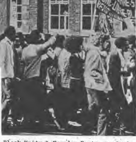
Black Unity & Freedom Party protest to Peckham police station, supported by London Alliance.