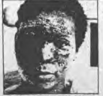
ting of the Sunderland Hoad bombing mained for life. The police turn a blind eye to these fascist attacks.