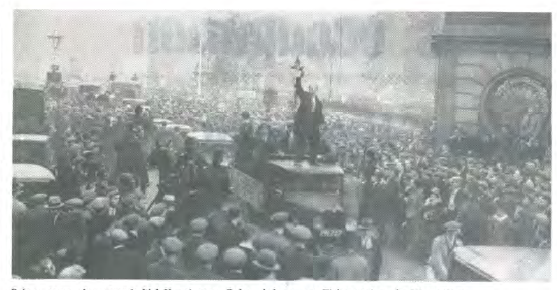
Below, centre foreground: Wal Hannington. Below, left corner: Fights against the Means Test.