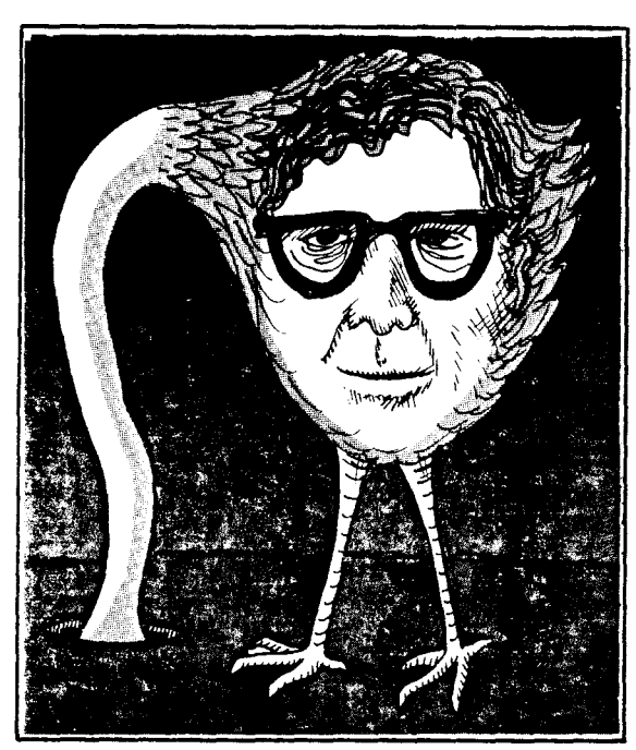
The Woodcock ostrich.

groups in the U.S. wind up, like PL. with their heads up the tail of the Woodcock ostrich. The CP and its youth group, Young Workers Liberation League (YWLL) are particularly consistent in this respect, making little pretense of opposition to the bureaucracy. The CP's Daily World always plays up the phony tactics of the "liberal" labor fakers, advertising them as though they were genuine. "Hit-Run Strikes Meet Challenge of GM Speedup." proclaimed its 19 October headline. Similarly, the CP supports Woodcock's fake call for "industrial democracy" under the slogan, "humanize the production line." Woodcock's position is