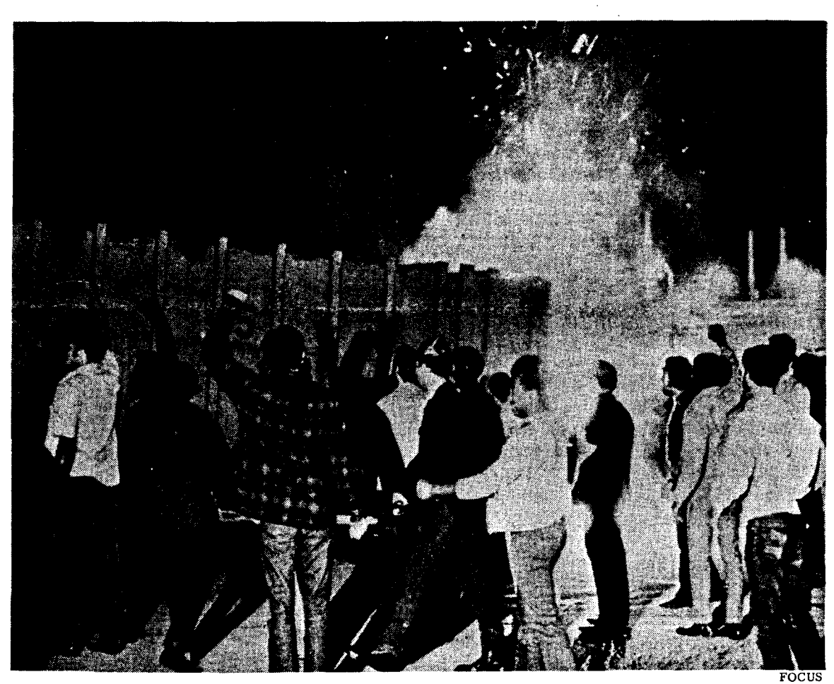
Fremont, Calif. auto workers on eve of 1970 GM strike move to prevent a shipment of trucks. "Radical" Paul Schrade, then West Coast UAW director, denounced action as work of students, formed liaison committee with cops against "outside agitators," set up goon squad and called tactical police to prevent rally called by oppositionist United Action Caucus.

The opportunists of the UNC appear to be vying with Woodcock for the favors of the imperialist rulers. Last spring's UAW Constitutional Convention endorsed a proposal to seek national legislation requiring federal licensing of multi-national corporations seeking to export capital. At its recent conference in Detroit, the official spokesman for the UNC on unemployment, MacFadden, called for the same thing: "restrictions on the export of capital" (See WV No. 17, March 1973). According to the UAW formula, such a license to export capital would be