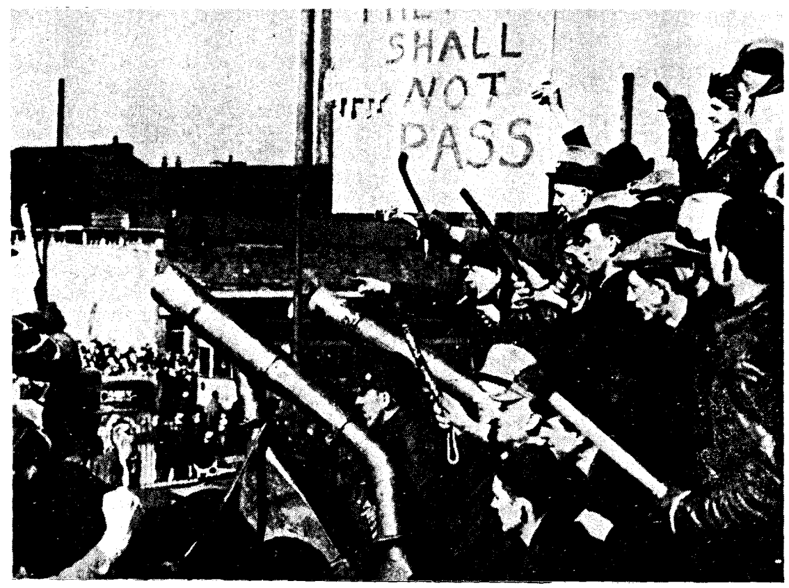
THE UAW IN PICTURES