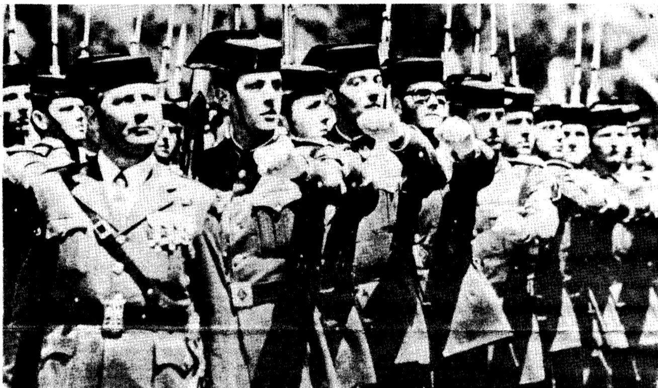
The Guardia Civil, Spain's hated internal security police.