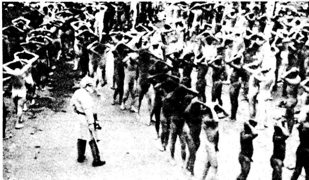
Attica prison, NY, in 1971 following slaughter ordered by Rockefeller to smash prisoners' revolt.

From John Davidson Rockefeller II who in 1914 ordered the murder of dozens of striking miners,