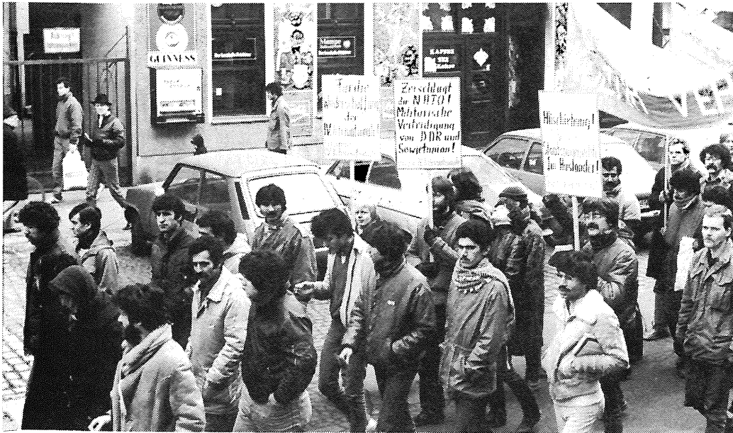
Gruppe IV. Internationale contingent, February 1983. Placards read: "For the Reforging of the 4th International!," "Smash NATO! Military Defense of the DDR and USSR!" and "No Deportations! Full Civil Rights for all Foreigners!"