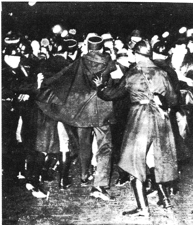
6 February 1934: Police battle fascist attempt to storm the Palais Bourbon

The evident bankruptcy of the Third Period and the KPD's collapse discredited the Stalinists in the eyes of many left-wing workers internationally. One of the consequences of this was that the principal beneficiaries of the renewed surge of proletarian militancy in 1934 were not the Comintern sections, but the reformist sections of the Second International, some of which began to emit quite unexpectedly radical noises and to sprout militant