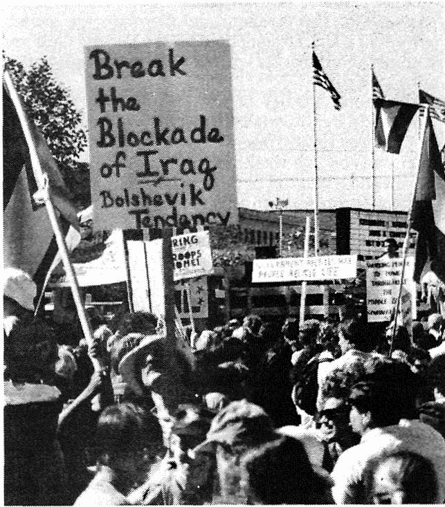
Bay Area demonstration against American military intervention in Middle East, 20 October 1990

The domestic political situation in the United States weighs heavily in the calculations of the imperialist chieftains as they prepare to unleash mass destruction on the people of Iraq. The White House has so far managed to keep a majority "on side," but the support is very shallow, and is shrinking. Many black, Hispanic and white working people do not like the idea of going to war for Big Oil.