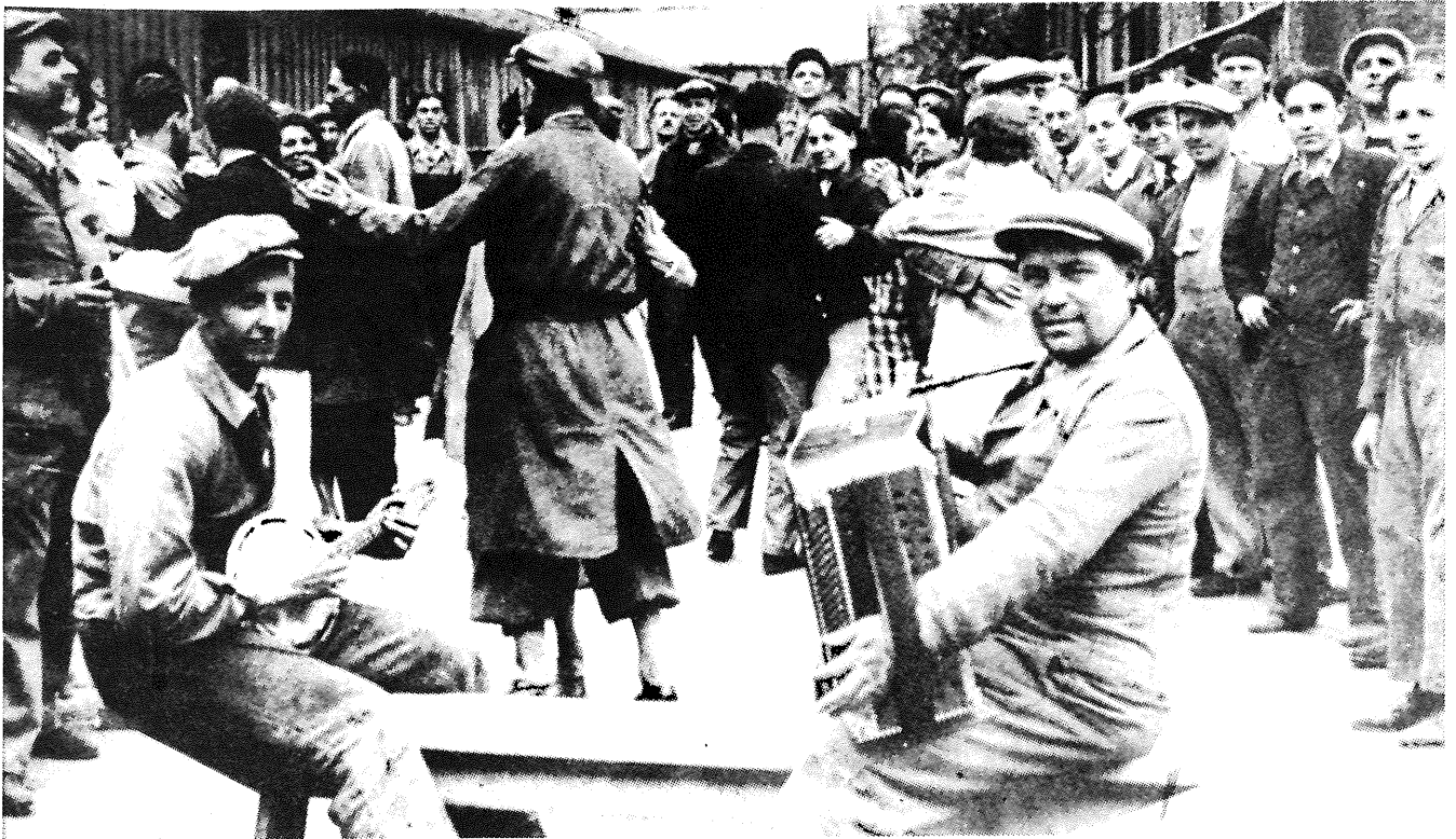
June 1936: French workers hold dance in occupied factory

For over a year Trotsky had been critical of the LC's petty apolitical factionalism, study-circle mentality and routinist failure to vigorously pursue the ICL's reorientation towards launching a new international. Trotsky had also hoped that bringing the LC members into contact with broader layers of working-class militants in the SFIO might serve as an antidote to some of the chronic ailments of the French section.