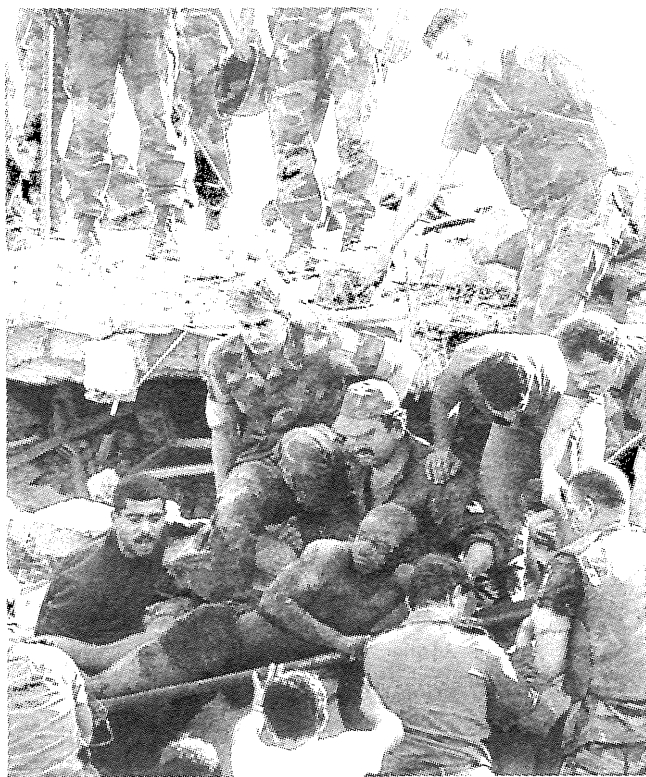
October 1983 demolition of Marines' barracks drove US military out of Lebanon

is a priori left to the leadership of the Marcyites and Socialist Action, then it's simply a self-fulfilling prophecy to say in advance that it will be dominated by the reformists."