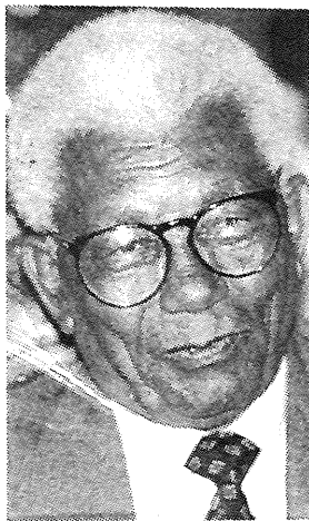
Walter Sisulu

The ANC's ferocious hostility, both physical and rhetorical, toward its "workerist" critics echoes the anti-Trotskyist campaign of the Stalin apparatus in the 1930s.