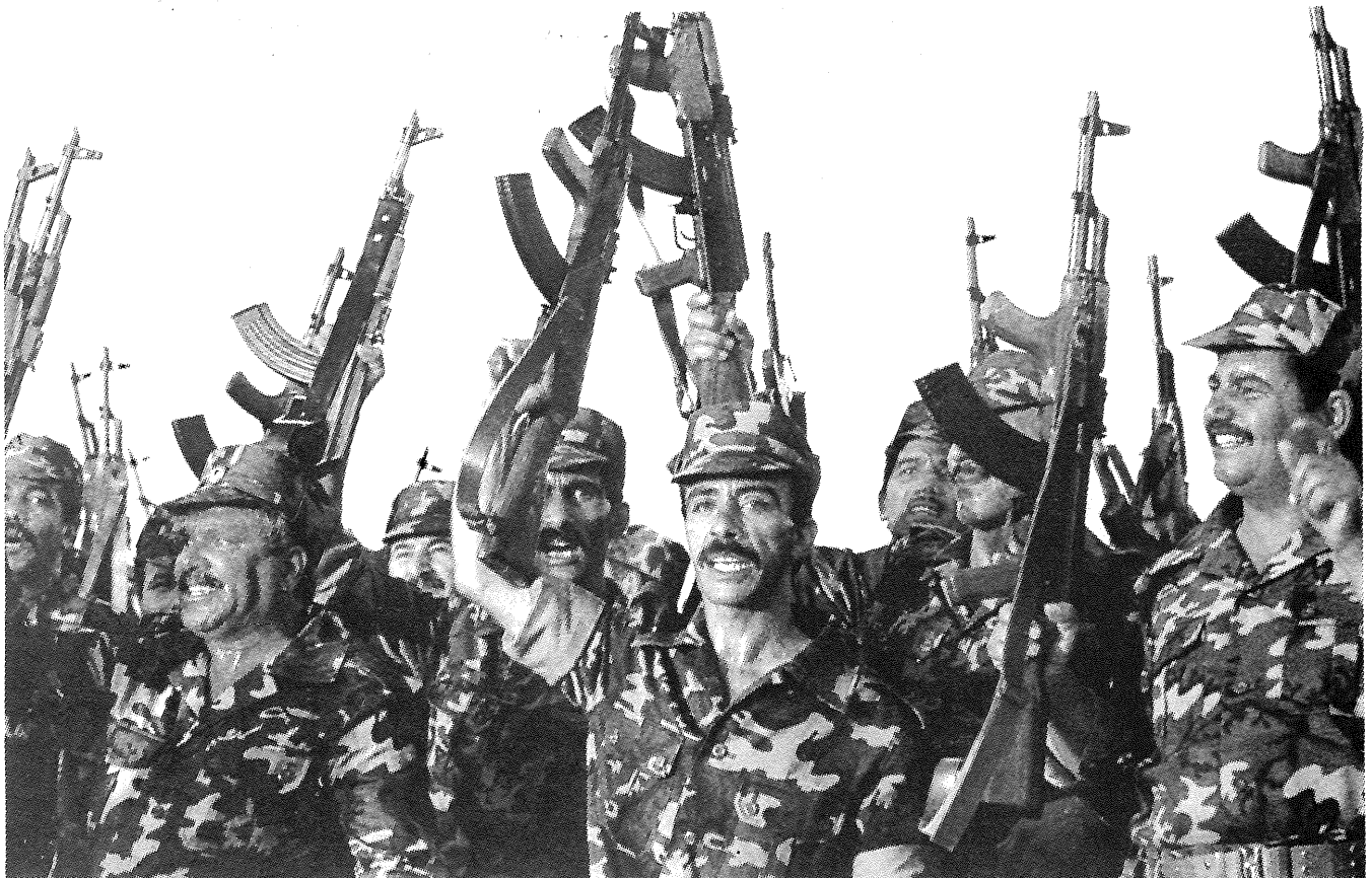
Members of Iraqi People's Army prepare to resist imperialist attack

The illusion that the "end of the Cold War" would usher in an era of global peace and harmony has been abruptly shattered by the recent imperialist provocations against Iraq. The U.S.-led intervention in the Middle East, ostensibly in response to the occupation of Kuwait by Iraq's Saddam Hussein, is designed to protect the interests of the big oil companies by establishing American military control of the Persian Gulf. A huge American army is encamped in Saudi Arabia and U.S. air and naval forces are deployed throughout the region. Britain, France, Canada, Australia, Germany and a host of smaller capitalist states are also participating in blockading Iraq. For public relations purposes the imperialist expeditionary force also includes a few thousand Arab auxiliaries from Egypt, Syria and Morocco.