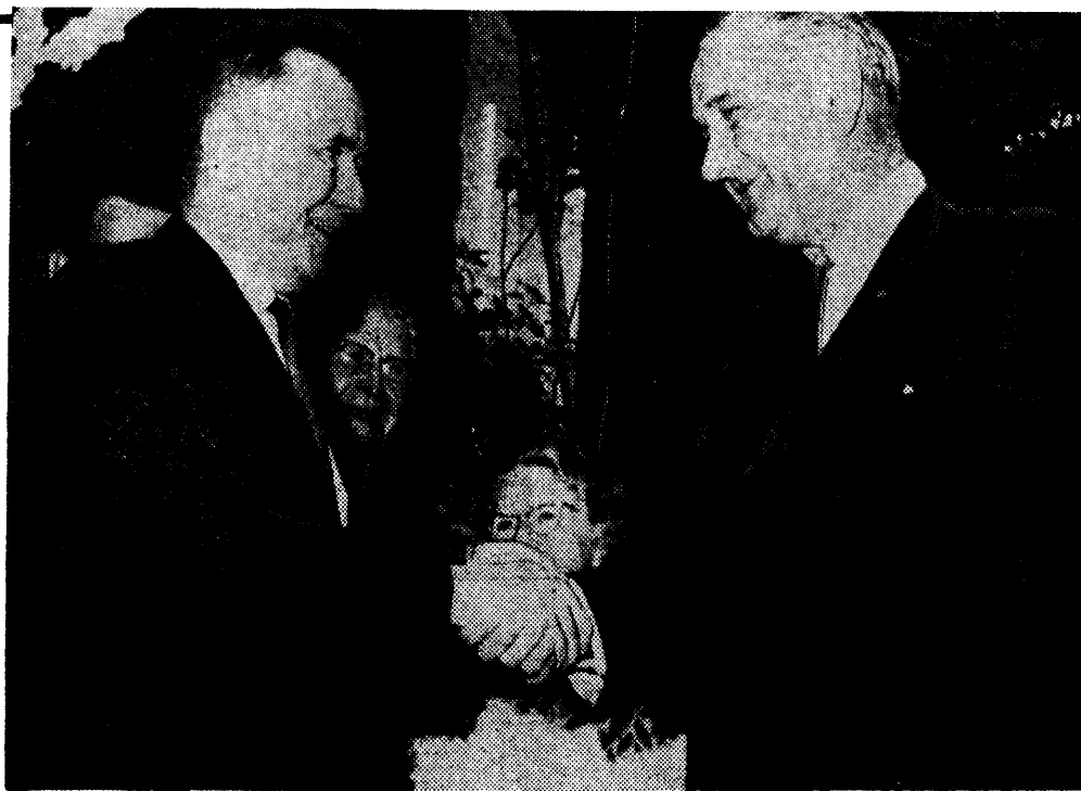
LBJ AND KOSYGIN SHAKE WHILE WORKERS DIE IN VIETNAM, SUEZ.

settlement in Vietnam with the aid of Kosygin. At the same time he opens up the possibility of strengthening an overt alliance, presently covert, with the USSR against China. Undoubtedly the testing of the Chinese H-bomb contributed to Johnson's interest in meeting with Kosygin.