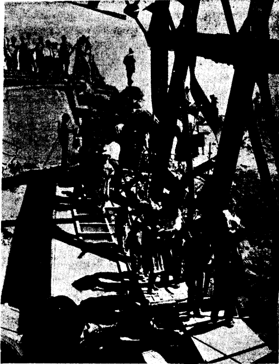
ARABS FLEE ZIONIST CONQUERORS.

Revolt seeks to relate these international struggles to the struggle of American working class youth and the American trade union movement. The very same crisis which forces the imperialist government to wage war on the Vietnamese workers and peasants forces them to also wage a