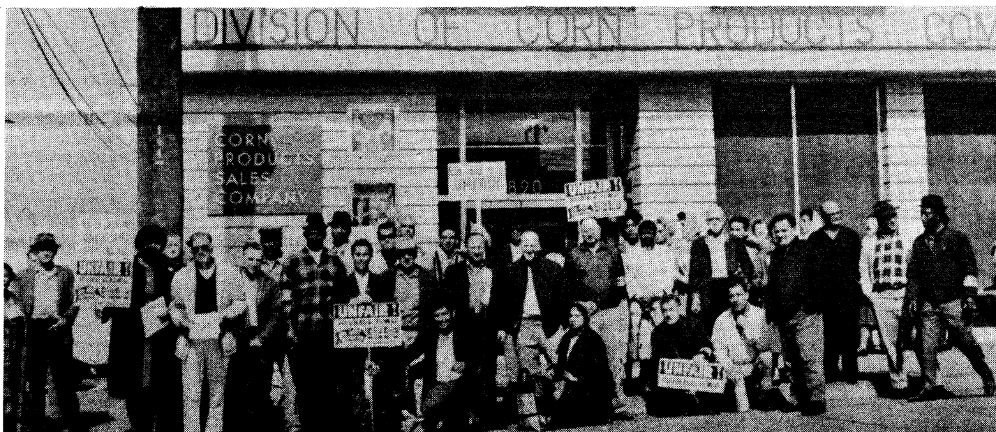
SOLID LINE OF WAREHOUSE UNION STRIKERS PICKET BEST FOODS PLANT IN SAN FRANCISCO.