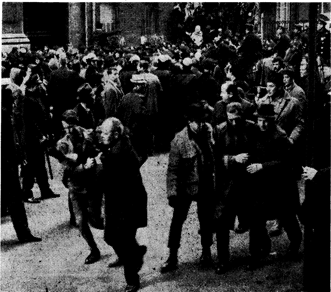
CONFRONTATION AT IRVING PLACE, N.Y.