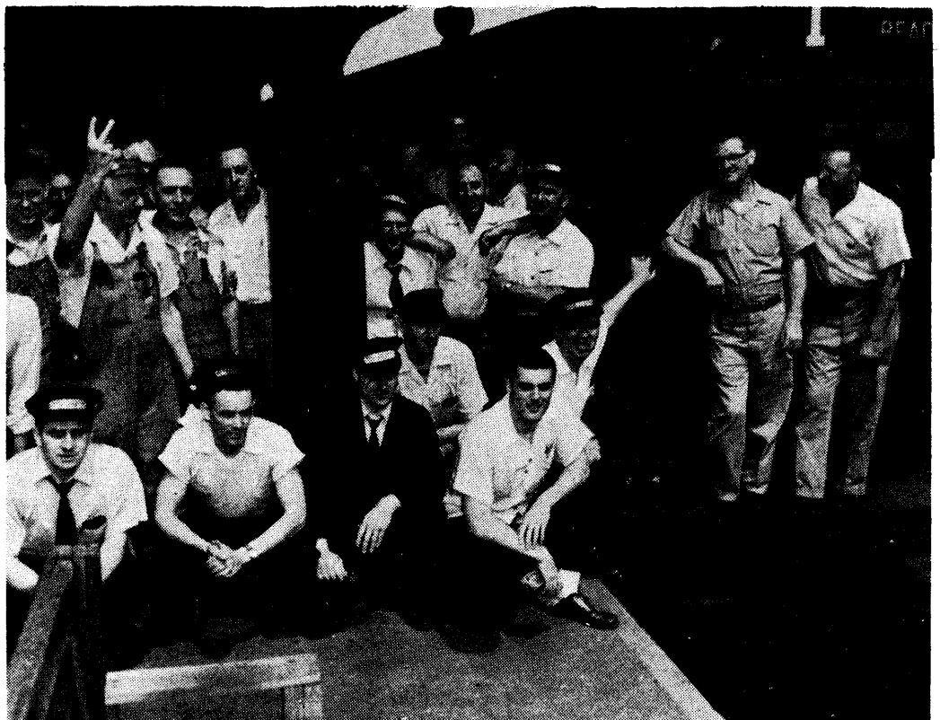
1956 WILDCAT STRIKE ON BROOKLYN SUBWAYS. TRANSIT WORKERS HAVE POWER TO BRING CITY TO STANDSTILL.