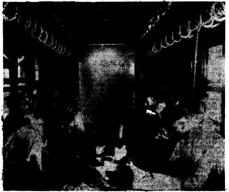
COPS PROTECT SCABS IN 1926 SUBWAY STRIKE.

This is why we seek to intervene to bring to rank and file transit workers a program of struggle with which they can go beyond these