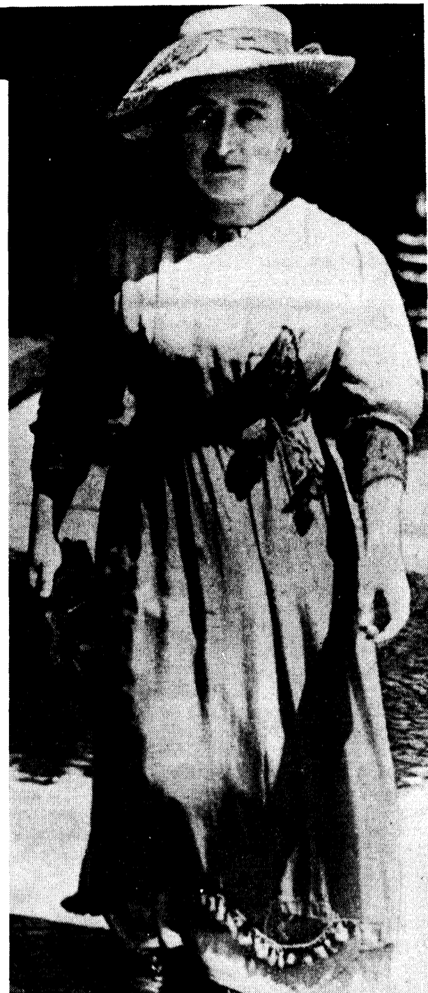
ROSA LUXEMBURG FOUGHT KPD'S ADVENTURISM

of the capitalist system -- that means building a disciplined Leninist party which is based in the working class. We say that the question of power must be posed to the working class today, that an alternative to Nixon-Humphrey-Wallace must be posed. This struggle must be posed today in the struggle for a labor party based on the trade unions, a party which has the power to really confront the ruling class. The working class will fight the state and the police but not under conditions determined by the state.