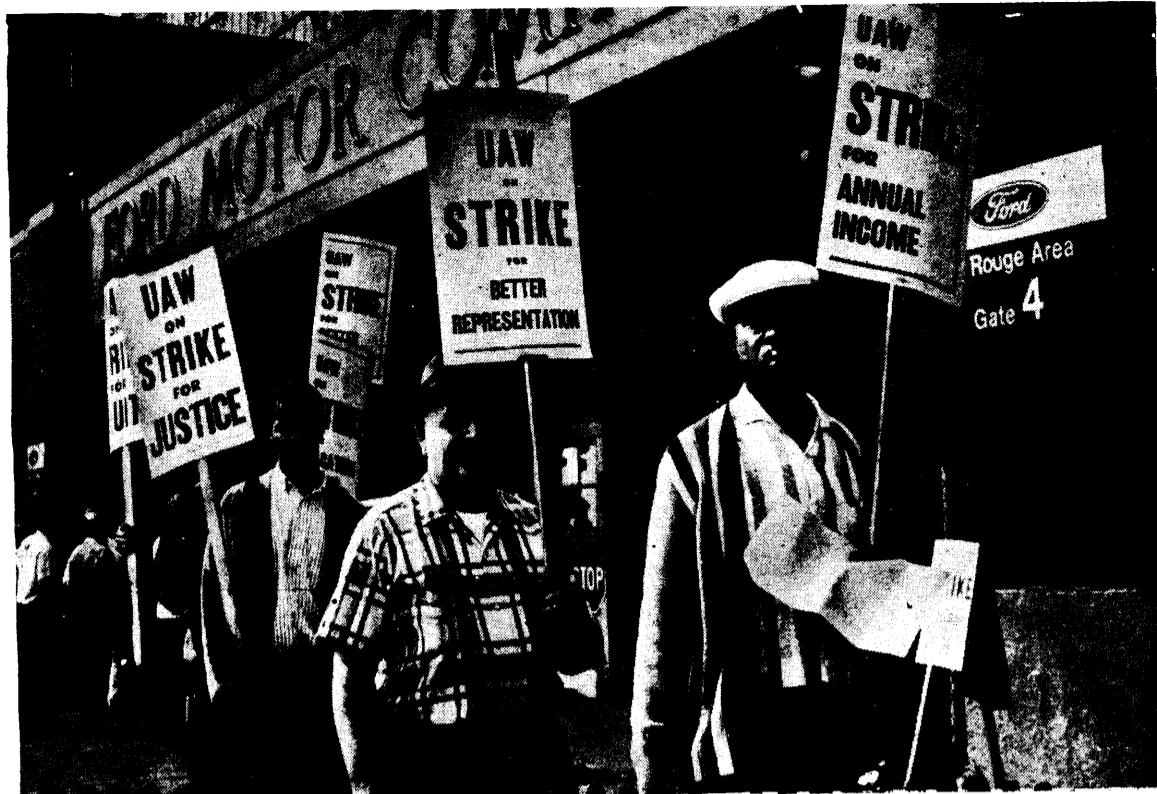
AUTO WORKER UNITY IS SPLIT BY WALLACE RACISM AND BLACK NATIONALISTS

In July DRUM called a strike of black workers. Even though the last strike had been led and supported by both black and white workers, DRUM made little or no effort to get the support of the white workers. DRUM sees "no possibility of collaboration with white workers." Rather than posing demands which would affect all rank and file workers, DRUM's demands were for "installment of 50 black foremen, 10 black general foremen, 3 black superintendents, a black plant