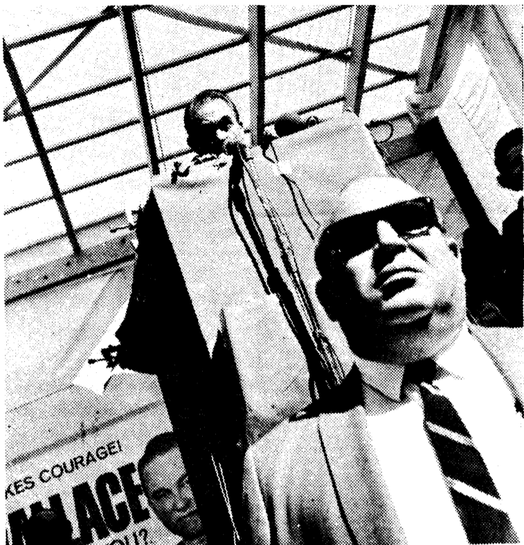
GEORGE WALLACE SPEAKS FROM BEHIND BULLETPROOF LECTERN