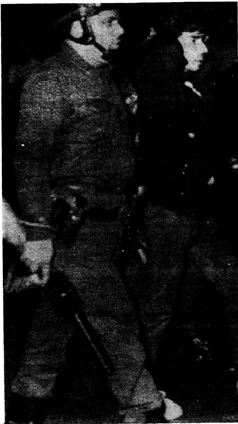
MEXICAN SOLDIER MARCHES OFF PROTESTER TO JAIL

At dusk on the evening of October 2, at the signal of flares dropped from a hovering helicopter, and in accordance with a previously taken decision ten thousand armed troops and riot police violently attacked a peaceful assembly of students which was being advised by its leaders to disband. This wanton and senseless assault resulted in the greatest massacre to have occurred in Mexico since the Revolution of 1910. By coincidence, the government chose to attack the students on the great square of Tlateloco, where almost four and a half centuries ago, in a similar military action, the last Aztec resistance crumbled before overwhelmingly superior Spanish troops.