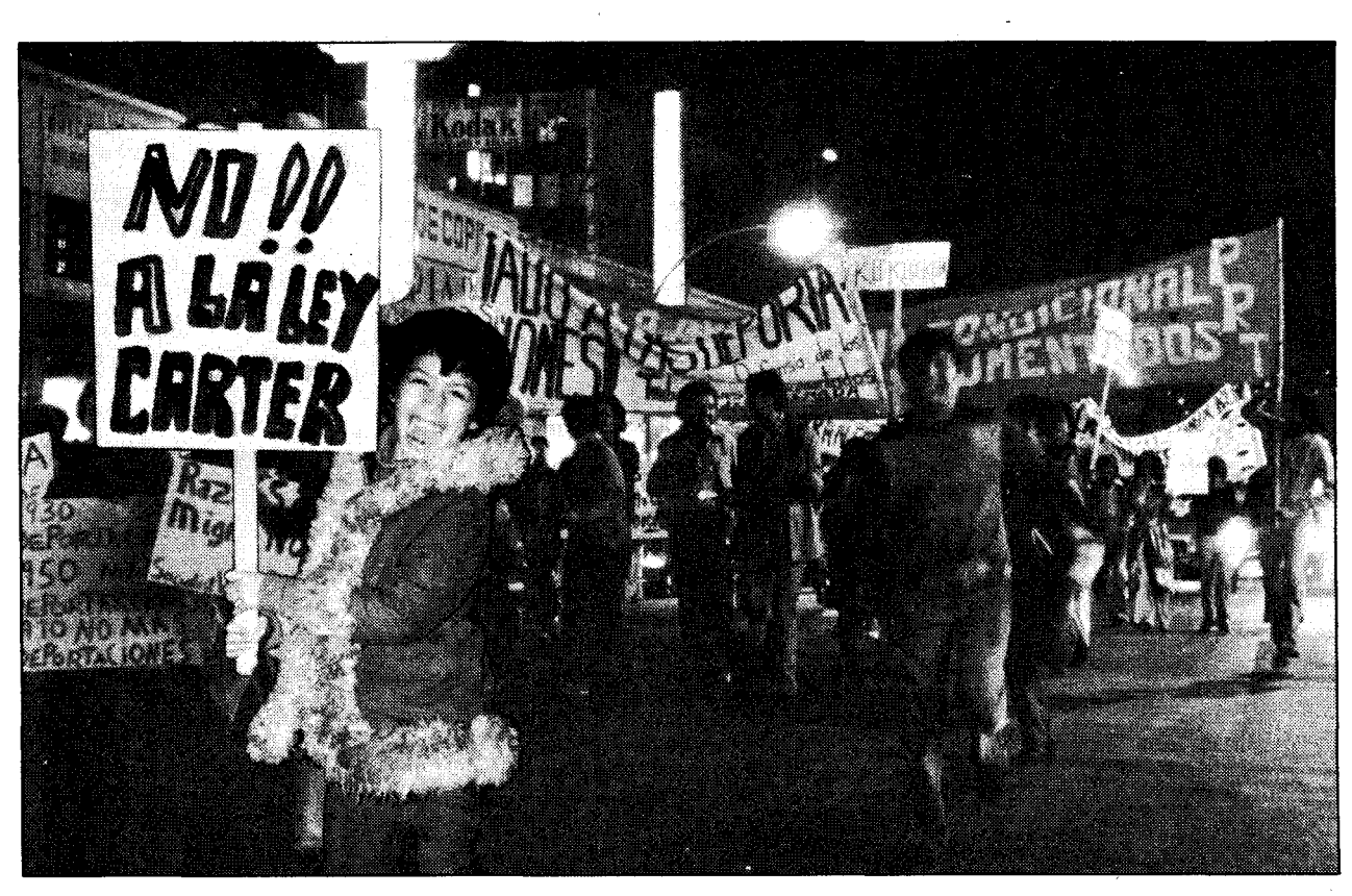
Youthful participant in Tijuana demonstration carries sign saying "NO! To Carter's Law."

TIJUANA—In an impressive display of international solidarity and the contagious enthusiasm engendered by it, over 500 Mexicans, Chicanos and Anglos rallied at a major intersection of downtown Tijuana, Mexico on Saturday night, November 19. Singing with great spirit, two hundred proudly marched two-and-a-half miles to the U.S. border. They held aloft picket signs that condemned Carter's immigration plan and demanded open borders, an end to massive raids and deportations, and amnesty, civil and human rights for undocumented workers.