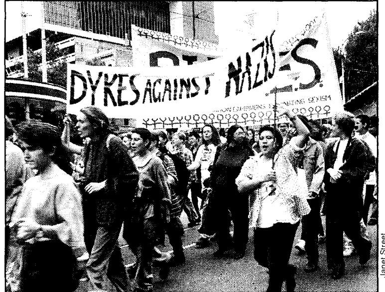
marched to the next suburb and protested outside the Citizens Electoral Council March 12, 1994. After successfully driving the Nazis out of Brunswick, these Australian bigot-busters carry their banner on to the International Women's Day march.

The anti-fascist crowd surged forward. The cops made an escape route that allowed NA to scurry up a side street.