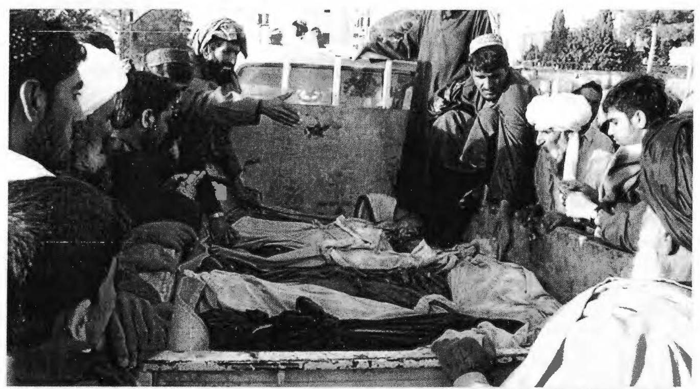
Bodies of some of 25-30 Afghan civilians killed in NATO air strike, October 16. Obama wants to escalate Afghanistan war.

The fact that for the first time ever a black man is the top candidate of one of the major parties and could likely be the next U.S. president, and that a woman was his chief opponent in the primary elections, marks a significant social shift in this country that will be widely seen as a breakthrough. Yet this does not change the fact that the Democrats and Republicans are both bourgeois parties who govern by and for the capitalist class against the interests of working people, of black, Latino and Asian racial/ethnic minorities, of immigrants and all the oppressed. Both candidates will continue the imperialist occupation of Iraq and both promise to escalate the war in Afghanistan. As the U.S. sinks in economic crisis, possibly leading to years of depression, both parties and both presidential contenders support the trillion-dollar bailout of Wall Street banks and do nothing as millions of families (particularly African Americans) lose their homes to the banks. We say that the imperialist war abroad is the same as the class war being waged against workers and the oppressed here "at home," and we must defeat this war by working-class action.