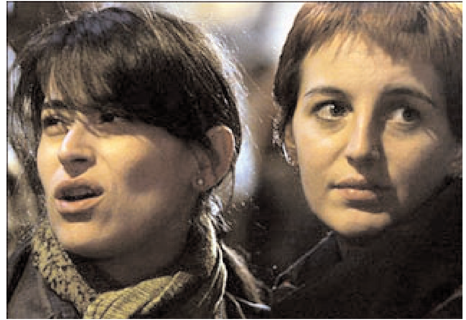
Italians waited late into the night to confirm Berlusconi's defeat

Certainly, in absolute terms there is a significant progress in a context in which all forces had the benefit of a higher voter