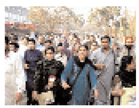
fundamentalist, conservative currents. The site of the forum was alive. It was a permanent theatre of demand-based demonstrations.

First element of success, and a major one, the WSF in Karachi opened a democratic and secular space between the pressure of the military regime and that of the