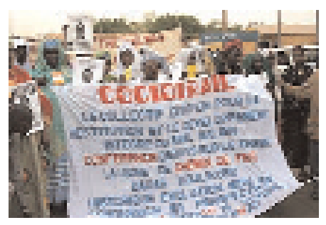
On the global character of the PWSF

In addition to the frustration caused by this low participation, there were problems connected to the fragmented localisation of the Forum, over a dozen sites, stretching from one extremity to another in a city deprived of an adequate system of public transport. As if the organising committee had no memory of the inconvenience resulting from the fragmented nature of the European Social Forum in Paris-Saint-Denis and the advantage of the concentrated localisation of the World Social Forum in Mumbai. This dispersal reduced the possibility of going immediately from one meeting or workshop to another and the possibilities of meeting and exchanges between participants belonging to different thematic networks. For example, few people were able to go from the House of Culture, the so-called "Universe of women" to the "Thomas Sankara" international youth camp, since they were situated at two extremes of the city.