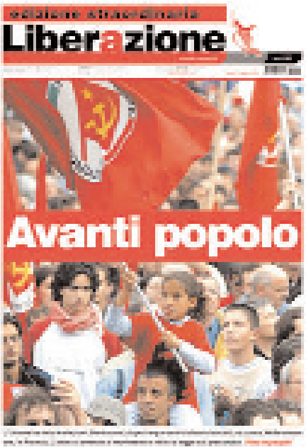
How Liberazione saw election outcome

For this reason, we view the call for the reestablishment of a "New sliding scale" as a necessary battle. Beside this, we are fighting for the introduction of a social wage to combat precarity, as well as a higher floor on pensions.