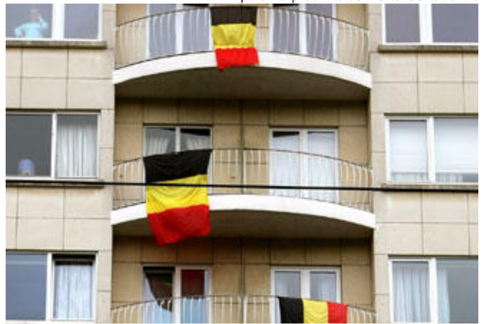
Belgians demonstrate their support for a unified state

For some, the bourgeoisie wishes to communalise the country still further, strengthening its division by dividing the working class. Divide and rule, in short. But things are not that simple. There is from all the evidence a real conflict inside the dominant class. There still exists inside it a unitarist, pro-Belgian faction, represented in part by the FEB [1], the Belgian employers' organisation) which, with the Royal Palace in the front line, prefers the old state apparatus of Belgium to a separatist adventure. And there is, above all in Flanders, an increasingly strong faction which desires the (partial?) dismantling of the Belgian state allowing it to discard a whole series of social compromises characteristic of the "old Belgium". When the Flemish parties present at the negotiating table [2] now propose to divide the labour market, it is obvious that their explicit intention is to dismantle the