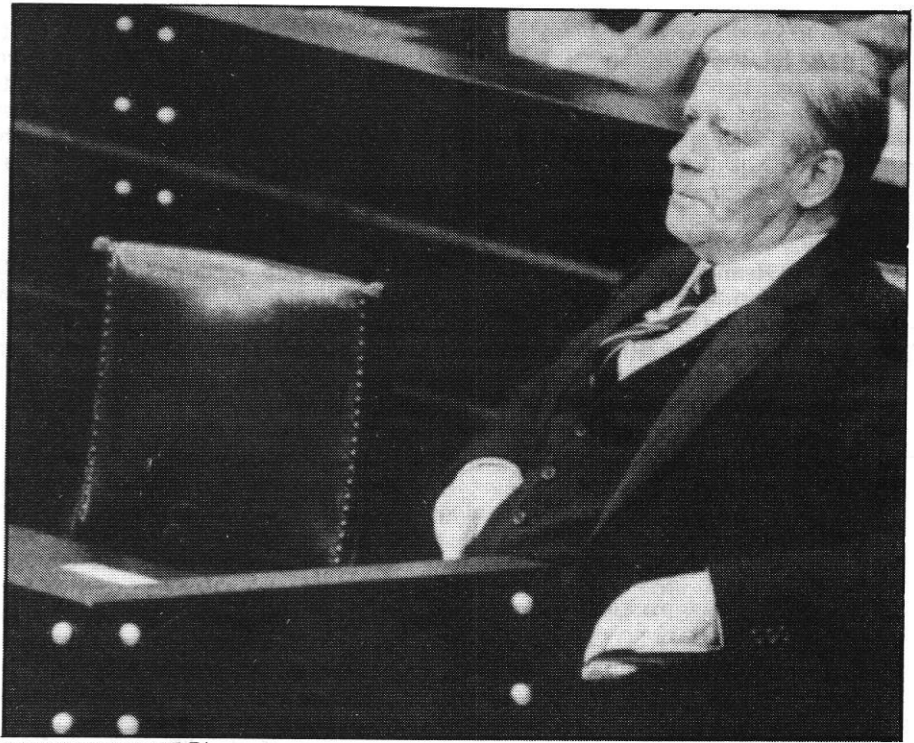
Helmut Schmidt.

Nonetheless, the SPD has never taken any initiative to challenge the essential juridical basis for revanchism, the constitution itself (7). Moreover, it should be noted that the new East European policy was a precondition for expanding trade