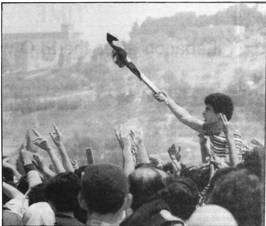
Arab demonstration in Jerusalem

A: The organization with which we work most closely is the Sons of The Village. This group is a continuation of an older Palestinian organisation called El Ard , The Land. Already before the war, it was