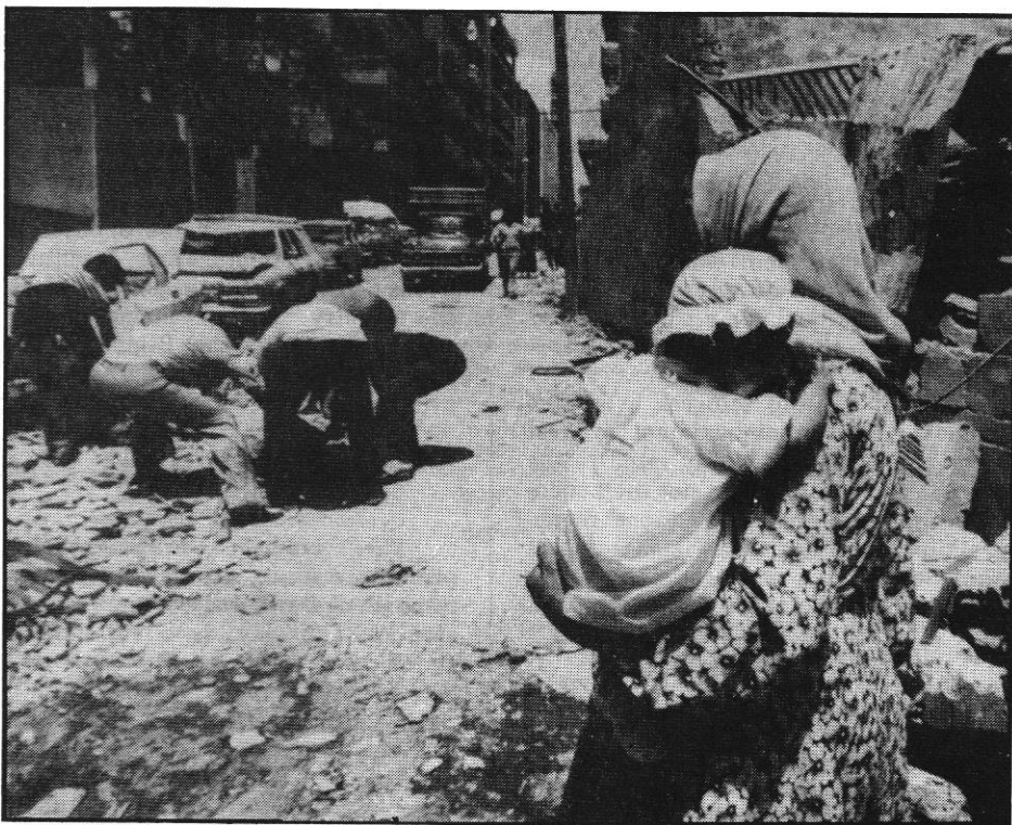
Beirut after bombardment (DR)

Certainly the Labour Party's strategy is to place itself within the new framework defined by the diplomatic proposals of the US government. Since Begin backed off, Shimon Peres declared that demanding the resignation of the government must be put off till later. But the commission of inquiry will not present any conclusions until next January. In the meantime, the political crisis will undoubtedly have had new rebounds. Its roots go to the situation created by the departure of the Fedayeen from Lebanon, and the concurrence of propositions of a negotiated settlement to the