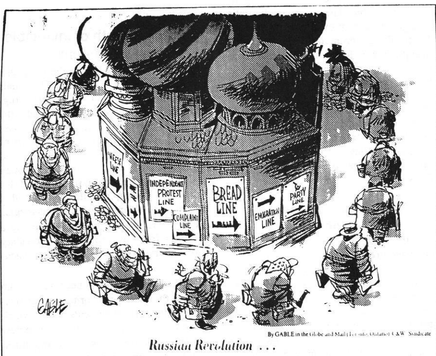
Russian Revolution ...