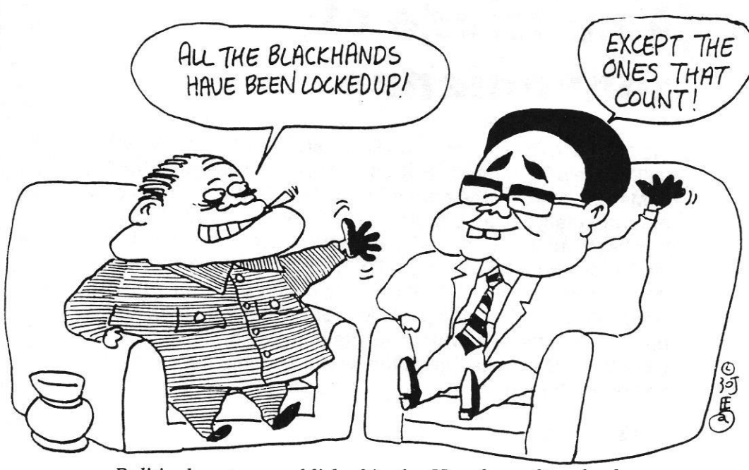
Political cartoon published in the Hongkong Standard

A clear sign of the weakness of this apparently strong regime has been the recent borrowing by the government. Two years earlier, a forced loan was imposed on wage-earners in the form of direct subtraction from wage-packets, that is a wage cut. Such outright authoritarianism is inconceivable today. In order to give the lender an impression that they are getting