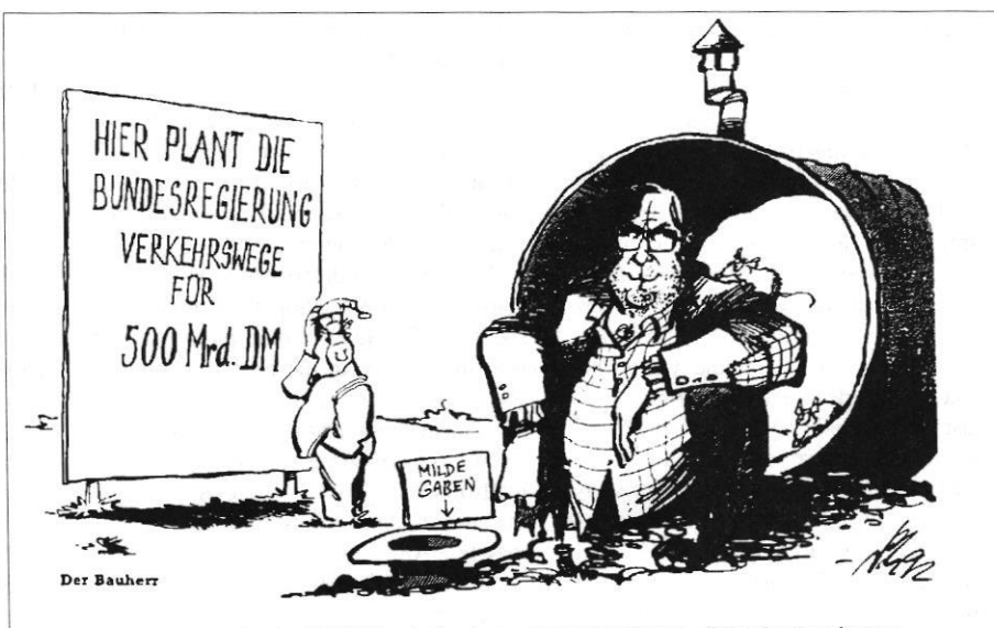
Proposed site for DM 500bn federal government highway. Donations welcome.

dit has been in the suppression of jobs—some three million of them until now. From an economic point of view privatization has flopped; only a tenth of full-time workers in East Germany work in the private sector.