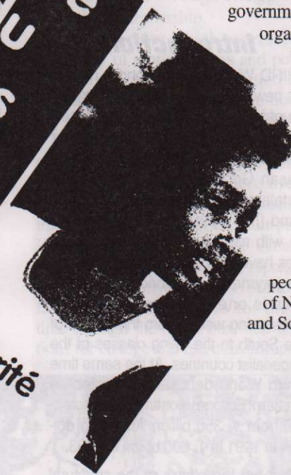
the peoples of North and South. ★

this problem, the solution lies in building coalitions between non-governmental organisations and