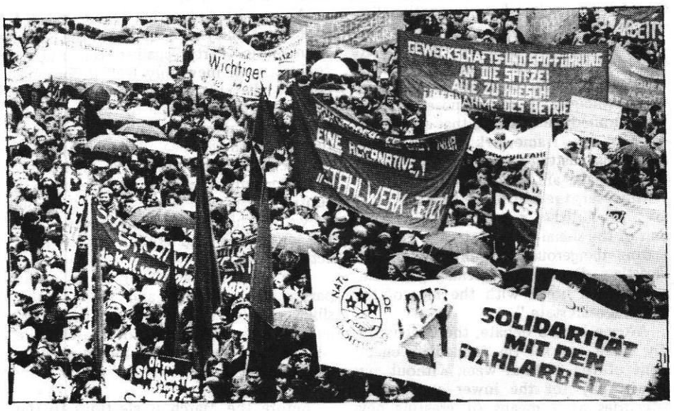
Steelworkers demonstration

Following the West German national parliamentary elections on March 6, the Swiss section of the Fourth International organized two public forums on the political situation in West Germany, along with another major left group, the POCH (Progressive Organizations of Switzerland).