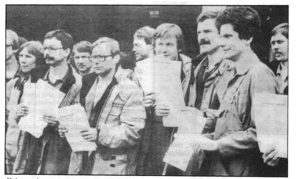
Volvo workers going to demand wage rise