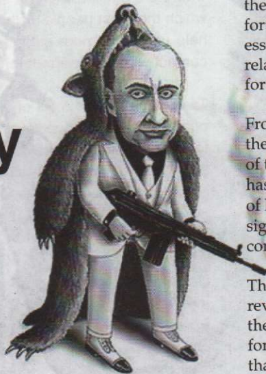
PUTIN-BOSS I GANGSTERSTAT

T hese traits can be summarized rapidly: