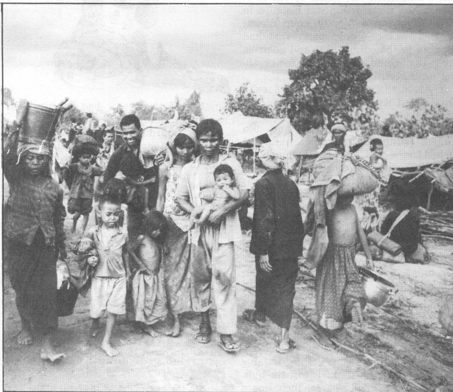
Cambodian refugees in Thailand (DR)

The national leadership remained largely ignorant of the real situation in the capital, since it was not on the spot. As a national organization, the CPT remained generally out of the picture, unable to propose concrete orientations for struggle and work, while the regime was regaining the initiative and the young generations were facing more and more complex and difficult tests.