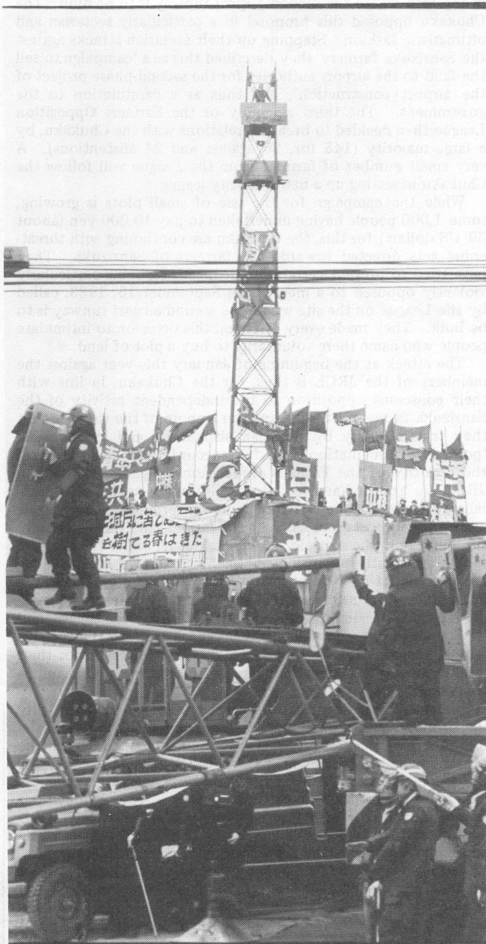
Occupation of the Narita airport control tower (DR)

Above and beyond the revolting and unacceptable character of the terrorist methods used by the Chukaku, even beyond the counter-revolutionary actions aimed at the whole of the Fourth International through the bloody aggression aimed at the mili-