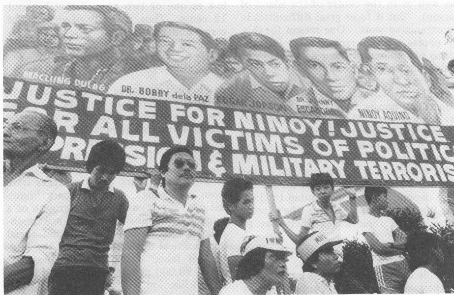
25,000 demonstrate in Manila against President Marcos

Even if the media are not so interested in it, the worsening of the social and economic situation in the countryside is also a major factor in the development of the national crisis in the Philippines. These problems have given impetus to peasant mobilizations and offer fertile soil for the communist guerrilla movement.