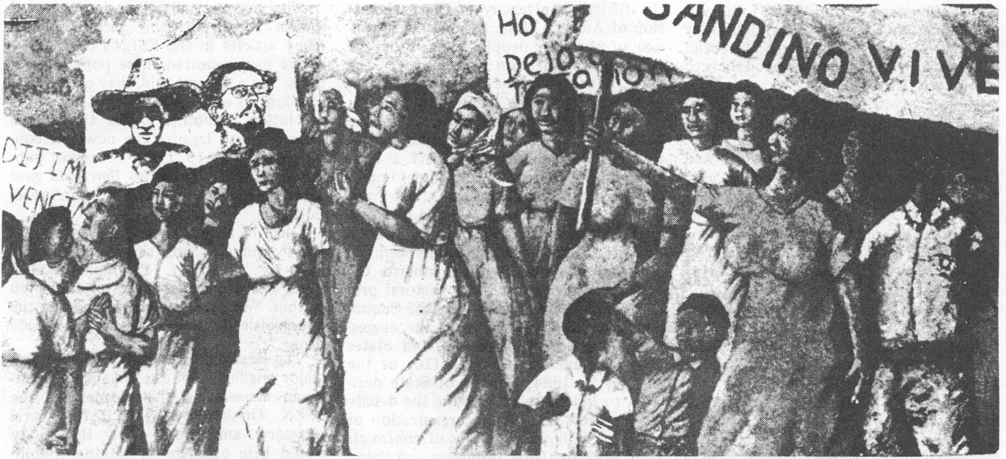
Election date was announced on the fiftieth anniversary of Sandino's assassination

the social weight of the peasant layers and the focus of the contra propaganda addressed to peasants led the Sandinista leadership to proclaim the "inalienability" of the land distributed to peasants, as well as of the land of "patriotic producers who respect the revolution." The reason for this move was a sentence at the end of the land reform titles granting land which stipulated that land was state property. The contras had used that sentence as grist for their anti-government propaganda mill. At the same time, a discussion has been initiated regarding the conditions under which land reform titles can be sold and on the specific limitations that should be imposed on potential purchases of such land to avoid the reconstitution of large estates.